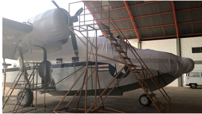
Grumman HU-16 Albatross Cockpit/Nose Cover and Engine Cover(test fit covers)