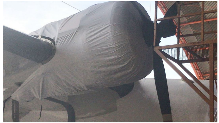
Grumman HU-16 Albatross Engine Cover (test fit cover)