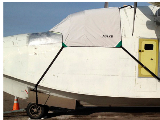
Grumman HU-16 Albatross Canopy Cover