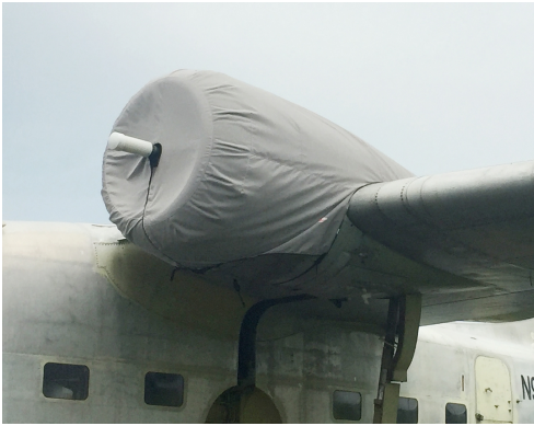
Grumman Albatross Engine Covers

This cover type is made from Silver Acrylic Sunbrella canvas and is 100% lined with a soft and smooth microfiber. Bruce's Custom Covers developed this material combination especially for aircraft protection. The outer material is medium weight and treated for water resistance, UV resistance and anti-static buildup. The inner lining is a very soft and smooth microfiber to prevent scratching. The material is very reflective, and tests show that the cabin interior temperature can be reduced to near-ambient temperature on the hottest of days. It is water, ice and snow repellent, yet breathable to allow moisture to escape from between the cover and the aircraft surface.