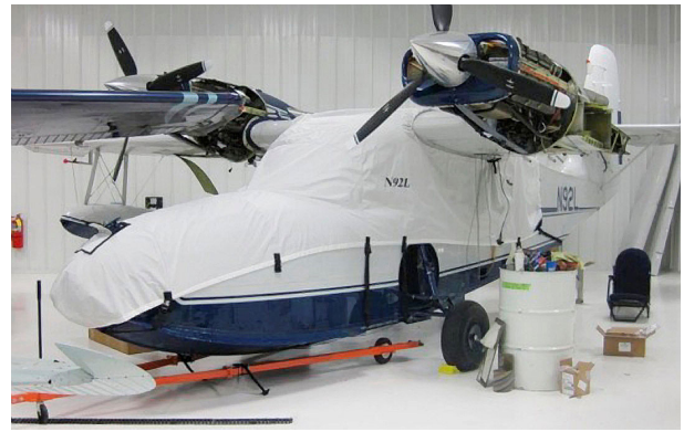
Grumman G44 Widgeon Canopy/Nose Cover