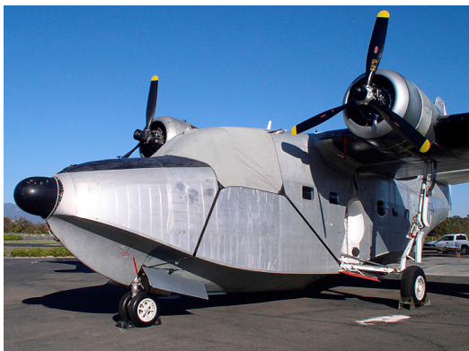
Canopy Cover for the Grumman HU-16 Albatross

This cover type is made from Silver Acrylic Sunbrella canvas and is 100% lined with a soft and smooth microfiber. Bruce's Custom Covers developed this material combination especially for aircraft protection. The outer material is medium weight and treated for water resistance, UV resistance and anti-static buildup. The inner lining is a very soft and smooth microfiber to prevent scratching. The material is very reflective, and tests show that the cabin interior temperature can be reduced to near-ambient temperature on the hottest of days. It is water, ice and snow repellent, yet breathable to allow moisture to escape from between the cover and the aircraft surface.