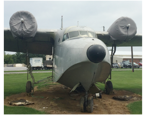
Grumman Albatross Engine Covers