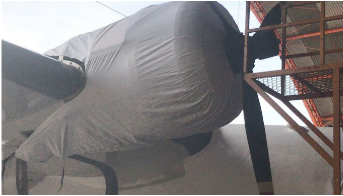
Grumman HU-16 Albatross Engine Cover (test fit cover)

This cover type is made from Silver Acrylic Sunbrella canvas and is 100% lined with a soft and smooth microfiber. Bruce's Custom Covers developed this material combination especially for aircraft protection. The outer material is medium weight and treated for water resistance, UV resistance and anti-static buildup. The inner lining is a very soft and smooth microfiber to prevent scratching. The material is very reflective, and tests show that the cabin interior temperature can be reduced to near-ambient temperature on the hottest of days. It is water, ice and snow repellent, yet breathable to allow moisture to escape from between the cover and the aircraft surface.