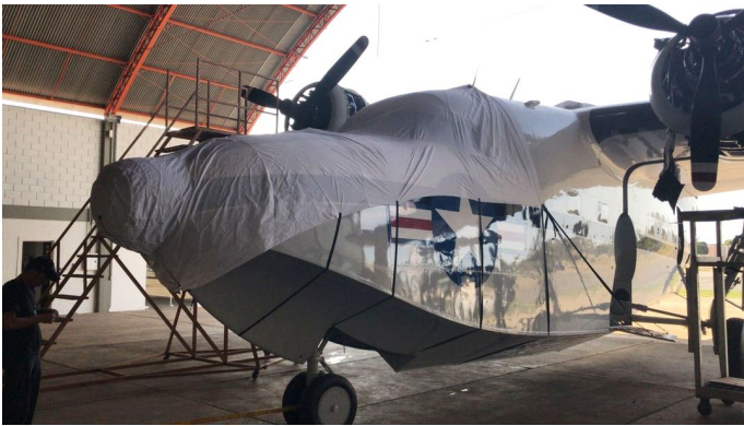
Grumman HU-16 Albatross Cockpit/Nose Cover (test fit cover)

This cover type is made from Silver Acrylic Sunbrella canvas and is 100% lined with a soft and smooth microfiber. Bruce's Custom Covers developed this material combination especially for aircraft protection. The outer material is medium weight and treated for water resistance, UV resistance and anti-static buildup. The inner lining is a very soft and smooth microfiber to prevent scratching. The material is very reflective, and tests show that the cabin interior temperature can be reduced to near-ambient temperature on the hottest of days. It is water, ice and snow repellent, yet breathable to allow moisture to escape from between the cover and the aircraft surface.