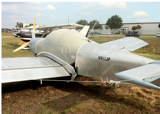
Zenith 601 XL Canopy Cover