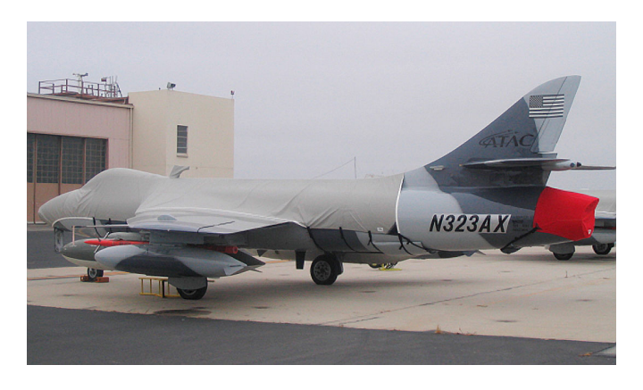
Hunter Fuselage & Exhaust Cover