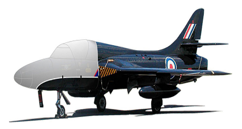
Hunter Canopy/Nose Cover (Illustration)