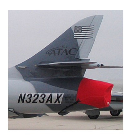
Hawker Hunter Exhaust Cover