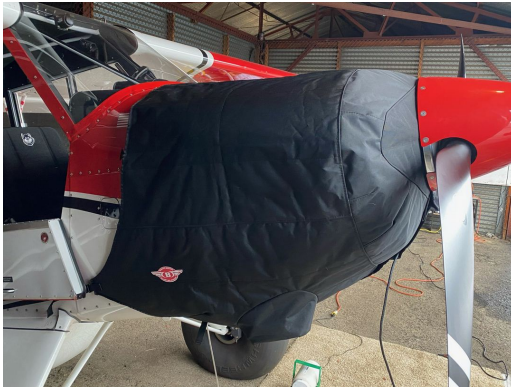
Aviat Husky insulated engine cover

This cover type is made from Silver Acrylic Sunbrella canvas and is 100% lined with a soft and smooth microfiber. Bruce's Custom Covers developed this material combination especially for aircraft protection. The outer material is medium weight and treated for water resistance, UV resistance and anti-static buildup. The inner lining is a very soft and smooth microfiber to prevent scratching. The material is very reflective, and tests show that the cabin interior temperature can be reduced to near-ambient temperature on the hottest of days. It is water, ice and snow repellent, yet breathable to allow moisture to escape from between the cover and the aircraft surface.