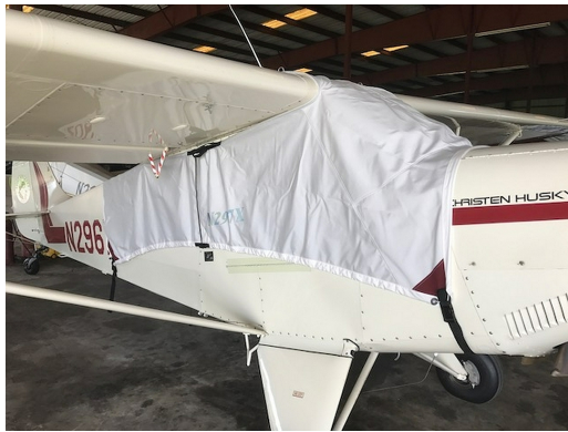
Aviat Husky Canopy Cover

This cover type is made from Silver Acrylic Sunbrella canvas and is 100% lined with a soft and smooth microfiber. Bruce's Custom Covers developed this material combination especially for aircraft protection. The outer material is medium weight and treated for water resistance, UV resistance and anti-static buildup. The inner lining is a very soft and smooth microfiber to prevent scratching. The material is very reflective, and tests show that the cabin interior temperature can be reduced to near-ambient temperature on the hottest of days. It is water, ice and snow repellent, yet breathable to allow moisture to escape from between the cover and the aircraft surface.