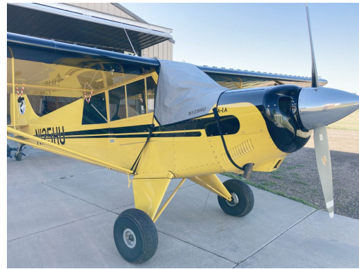
Aviat Husky Windshield/Skylight Cover