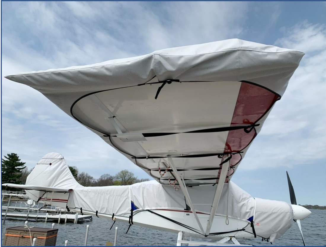
Aviat Husky Canopy, Engine, Wing, Empennage Covers