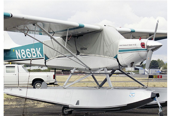
Aviat Husky Canopy Cover and Inlet Plugs