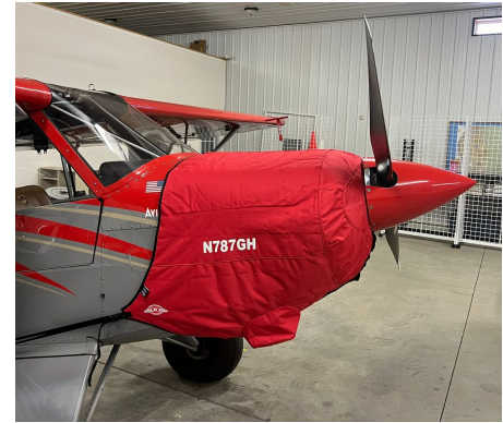
Aviat Husky Insulated Engine Cover