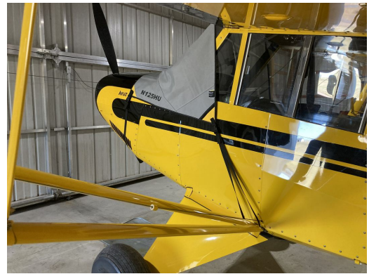
Aviat Husky Windshield/Skylight Cover