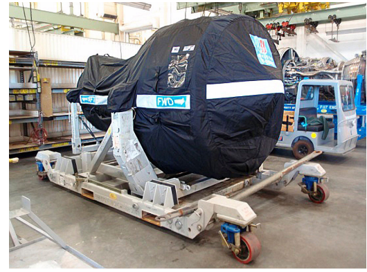
QEC OFF-LINK JET ENGINE COVER, V2500 Series, fully enclosed