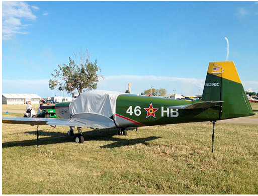
IAR Canopy Cover

the hottest of days. It is water, ice and snow repellent, yet breathable to allow moisture to escape from between the cover and the aircraft surface.