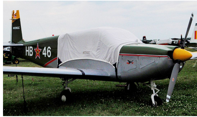
IAR Canopy Cover