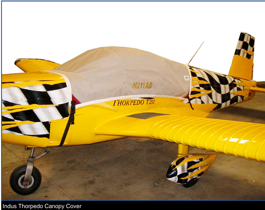
Indus Thorpedo Canopy Cover