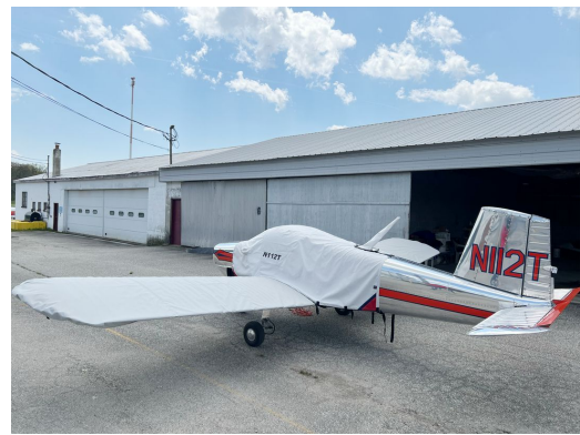
Thorp Sky Scooter Extended Canopy Cover & Wing Covers