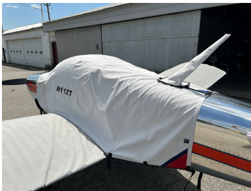
Thorp Sky Scooter Extended Canopy Cover & Wing Covers

WINTER USE MATERIAL - Made with Solution-Dyed Polyester fabric, this option is intended for seasonal use to aid in deicing, rain mitigation, or for occasional travel. The material is lighter and more compact, but more susceptible to UV damage and may have a shorter useful life if used continuously outside than the all-year use material.