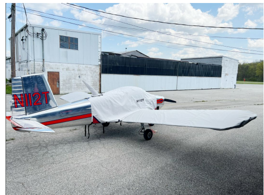
Thorp Sky Scooter Extended Canopy Cover & Wing Covers