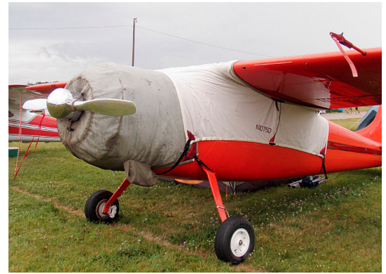
Cessna 195 Over-Top Canopy Cover & Engine Cover