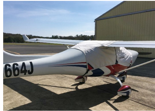
Jabiru J230-SP Canopy Cover, Over-Top Style