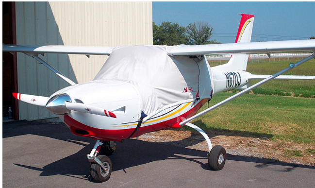
Jabiru 170 Canopy Cover

This cover type is made from Silver Acrylic Sunbrella canvas and is 100% lined with a soft and smooth microfiber. Bruce's Custom Covers developed this material combination especially for aircraft protection. The outer material is medium weight and treated for water resistance, UV resistance and anti-static buildup. The inner lining is a very soft and smooth microfiber to prevent scratching. The material is very reflective, and tests show that the cabin interior temperature can be reduced to near-ambient temperature on the hottest of days. It is water, ice and snow repellent, yet breathable to allow moisture to escape from between the cover and the aircraft surface.