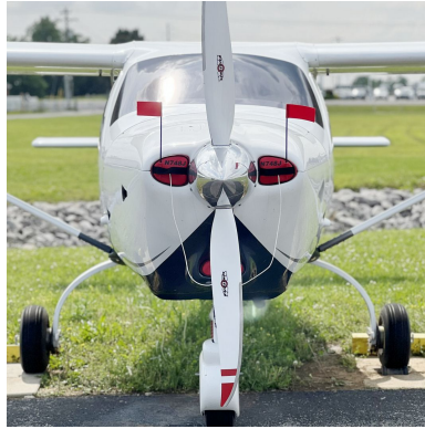
Jabiru J230-SP Engine Inlet Plugs