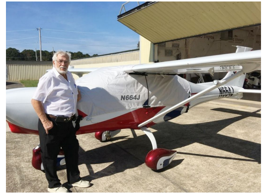
Jabiru 230SP Canopy Cover, Over-Top Style