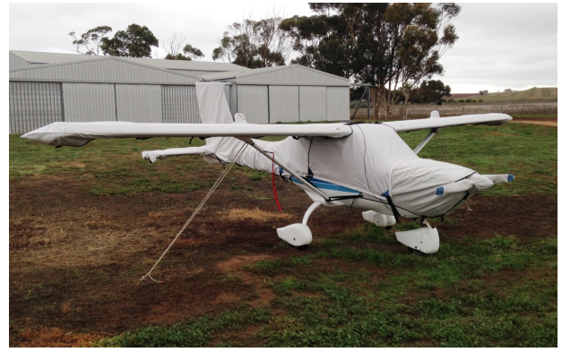
Jabiru 160 Canopy, Engine, Prop, Wings & Empennage Covers Jabiru 160 Canopy, Engine, Prop, Wings & Empennage Covers