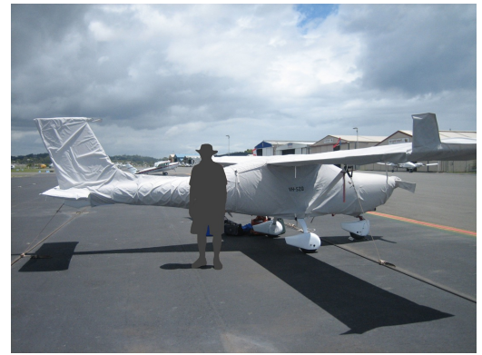
Jabiru J430 Complete Cover Set