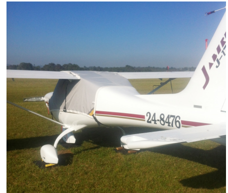
Jabiru 170 Canopy Cover