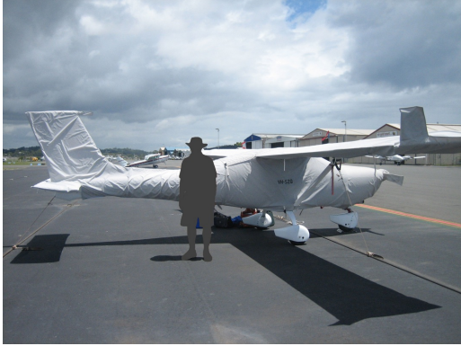
Jabiru J430 Complete Cover Set

Designed to prevent damage to the aircraft extremities in crowded hangars, these products are made of bright red Naugahyde and thickly padded with a sandwich of closed cell foam.