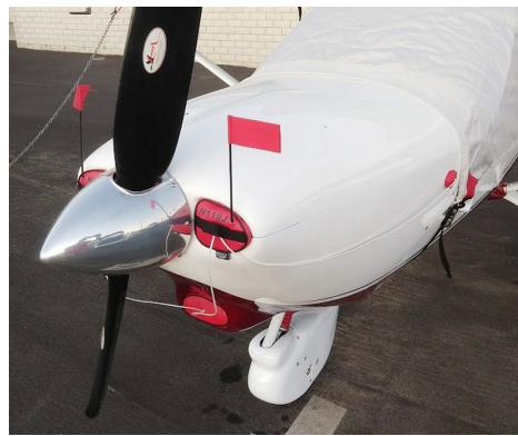
Jabiru 430 Engine Inlet Plugs