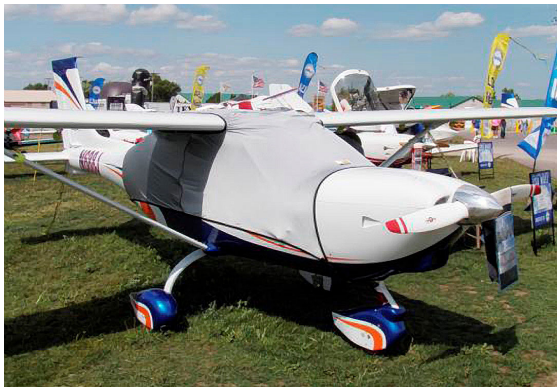
Jabiru Spandex FlyAway Travel Canopy Cover

Travel Covers are made with Silver Solution-Dyed Polyester fabric and only lined over the windshield to save weight. The material is lightweight and more compact for easy stowage in the aircraft. The polyester material is water resistant, but only intended for occasional use outside. We also have an ultra lightweight material available for fitted hangar dust covers. For daily outdoor use, the non-travel Sunbrella Cover is the best choice.