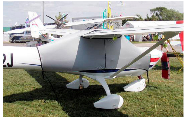
Jabiru Spandex FlyAway Travel Canopy Cover