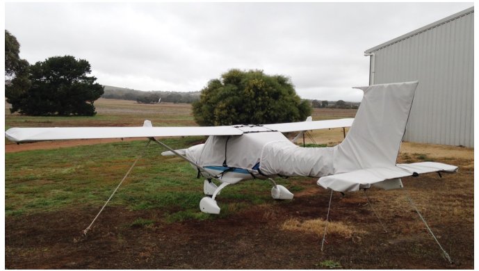
Jabiru 160 Canopy, Engine, Prop, Wings & Empennage Covers Jabiru 160 Canopy, Engine, Prop, Wings & Empennage Covers