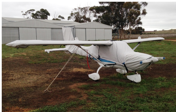
Jabiru 160 Canopy, Engine, Prop, Wings & Empennage Covers