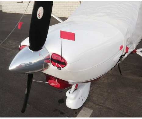
Jabiru 430 Engine Inlet Plugs