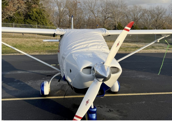
Jabiru J230-SP Extended Canopy Cover

This cover type is made from Silver Acrylic Sunbrella canvas and is 100% lined with a soft and smooth microfiber. Bruce's Custom Covers developed this material combination especially for aircraft protection. The outer material is medium weight and treated for water resistance, UV resistance and anti-static buildup. The inner lining is a very soft and smooth microfiber to prevent scratching. The material is very reflective, and tests show that the cabin interior temperature can be reduced to near-ambient temperature on the hottest of days. It is water, ice and snow repellent, yet breathable to allow moisture to escape from between the cover and the aircraft surface.