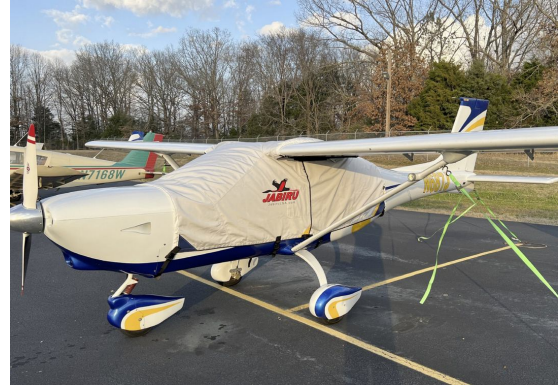
Jabiru J230-SP Extended Canopy Cover