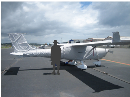
Jabiru J430 Complete Cover Set

This cover type is made from Silver Acrylic Sunbrella canvas and is 100% lined with a soft and smooth microfiber. Bruce's Custom Covers developed this material combination especially for aircraft protection. The outer material is medium weight and treated for water resistance, UV resistance and anti-static buildup. The inner lining is a very soft and smooth microfiber to prevent scratching. The material is very reflective, and tests show that the cabin interior temperature can be reduced to near-ambient temperature on the hottest of days. It is water, ice and snow repellent, yet breathable to allow moisture to escape from between the cover and the aircraft surface.