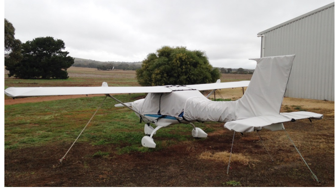
Jabiru 160 Canopy, Engine, Prop, Wings & Empennage Covers