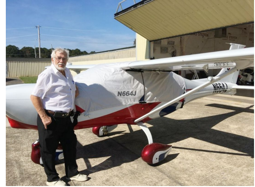
Jabiru 230SP Canopy Cover, Over-Top Style