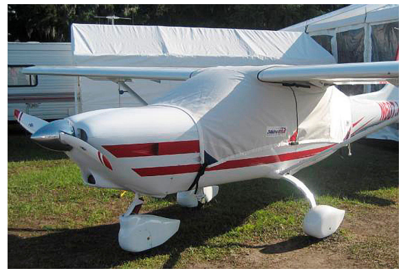
Jabiru 230-SP Canopy Cover, Over-top style