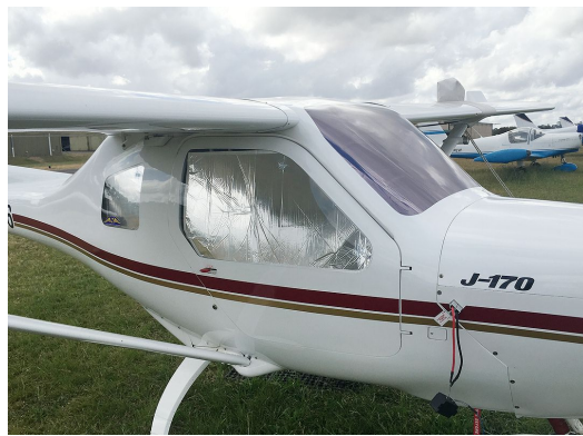
Jabiru 170 Heatshield Set