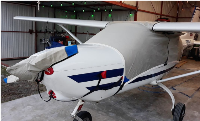
Jabiru J250 Canopy & Prop Cover

This cover type is made from Silver Acrylic Sunbrella canvas and is 100% lined with a soft and smooth microfiber. Bruce's Custom Covers developed this material combination especially for aircraft protection. The outer material is medium weight and treated for water resistance, UV resistance and anti-static buildup. The inner lining is a very soft and smooth microfiber to prevent scratching. The material is very reflective, and tests show that the cabin interior temperature can be reduced to near-ambient temperature on the hottest of days. It is water, ice and snow repellent, yet breathable to allow moisture to escape from between the cover and the aircraft surface.