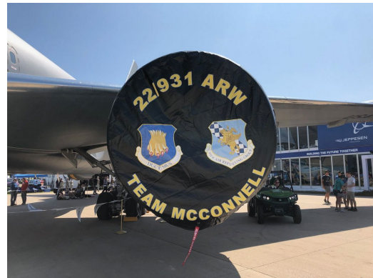
Boeing KC-46 Intake Cover