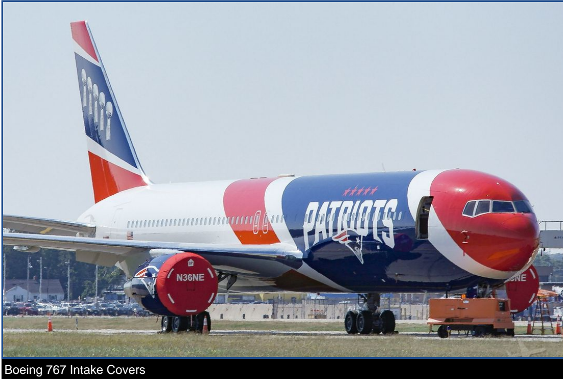
Boeing 767 Intake Covers