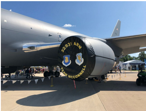
Boeing KC-46 Intake Cover