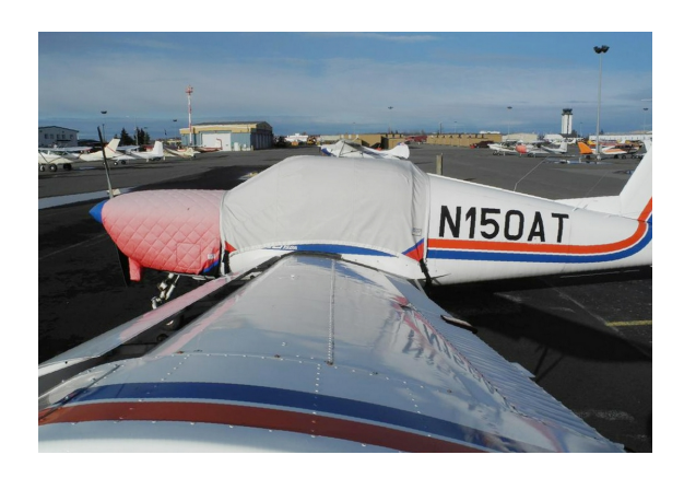
Koliber 150A Canopy Cover, Insulated Engine Cover