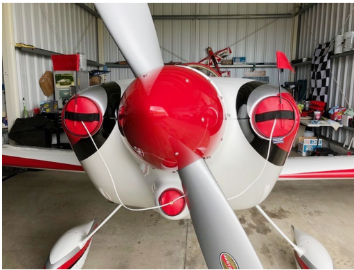
Van's RV-8 Engine Inlet Plugs, Sam James Cowl

Engine Inlet Plugs are custom fit for your Rand-Robinson KR-2 intakes, made with heavy-duty vinyl material, and stuffed with a single block of sculpted urethane foam. Each plug has a zipper that allows the foam to be removed and dried if necessary. Engine plugs have warning flags that are visible from the cockpit or 'remove before flight' streamers sewn onto the face of the plugs. Most plugs are imprinted with the aircraft registration number in black for an extra charge. Storage bag NOT included. Engine plugs may be inserted after flight when the engine is still warm. Engine Inlet Plugs are commonly referred to as Cowl Plugs, Intake Plugs, Cowl Blocks, Engine Blocks, and Engine Bungs.