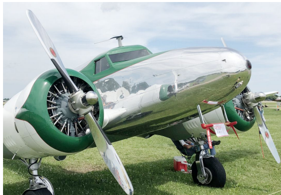
Lockheed 12 Pitot Covers

Lockheed 12 Electra Pitot Tube Covers , NOT HEAT RESISTANT TYPE, are made of Naugahyde vinyl, and are designed to cover the entire pitot assembly. Slipping over the tube, the cover tightens around the base with a Velcro strap detail. A "Remove Before Flight" streamer is attached to the cover. Heat Resistant Pitot Covers are an upgrade to this design, and help prevent the pitot cover from melting onto the tube if the pitot heat is accidentally turned on while installed. If you want the set tethered together, please let us know.