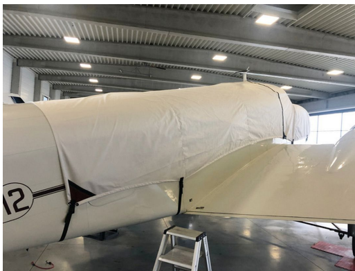
Lockheed 12 Canopy/Nose Cover

This cover type is made from Silver Acrylic Sunbrella canvas and is 100% lined with a soft and smooth microfiber. Bruce's Custom Covers developed this material combination especially for aircraft protection. The outer material is medium weight and treated for water resistance, UV resistance and anti-static buildup. The inner lining is a very soft and smooth microfiber to prevent scratching. The material is very reflective, and tests show that the cabin interior temperature can be reduced to near-ambient temperature on the hottest of days. It is water, ice and snow repellent, yet breathable to allow moisture to escape from between the cover and the aircraft surface.