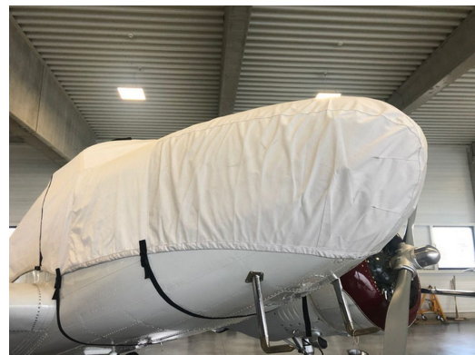
Lockheed 12 Canopy/Nose Cover