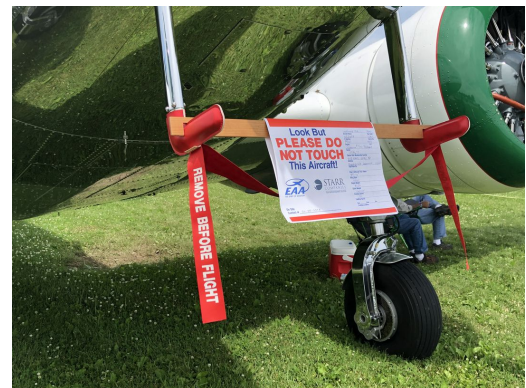
Lockheed 12 Pitot Covers