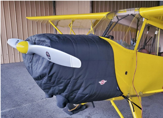
Aeronca Champ 7AC Insulated Engine Cover

This cover type is made from Silver Acrylic Sunbrella canvas and is 100% lined with a soft and smooth microfiber. Bruce's Custom Covers developed this material combination especially for aircraft protection. The outer material is medium weight and treated for water resistance, UV resistance and anti-static buildup. The inner lining is a very soft and smooth microfiber to prevent scratching. The material is very reflective, and tests show that the cabin interior temperature can be reduced to near-ambient temperature on the hottest of days. It is water, ice and snow repellent, yet breathable to allow moisture to escape from between the cover and the aircraft surface.