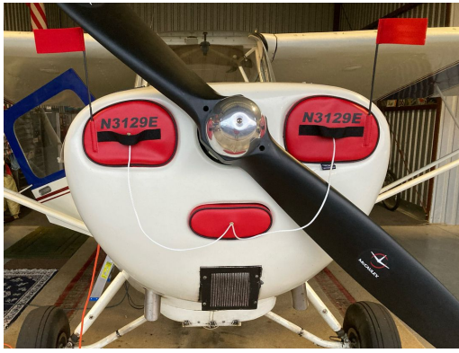
Aeronca Champ Engine Plugs