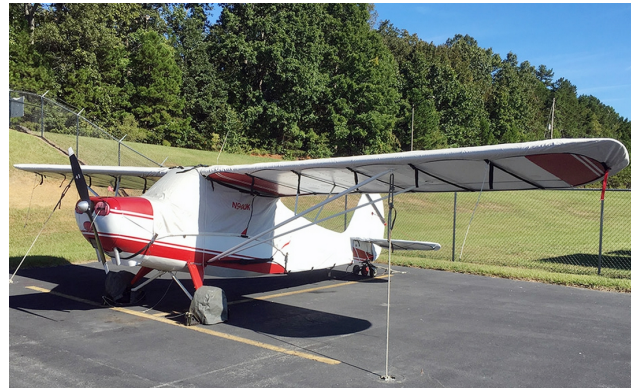
Aeronca Champ 7AC/7EC Wing and Canopy Cover (Over-The-Top Style)