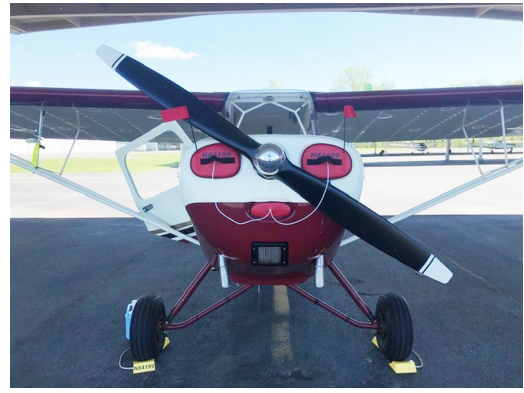
Aeronca Champ 7AC, 7EC Engine Inlet Plugs