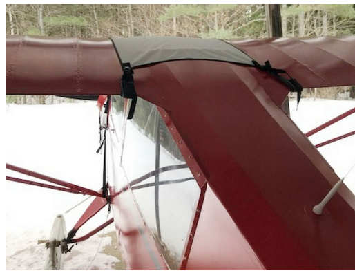
Aeronca Champ Windshield/Skylight Cover