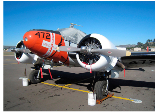
Beech 18 Cockpit Cover and Carb Air Inlet Plugs