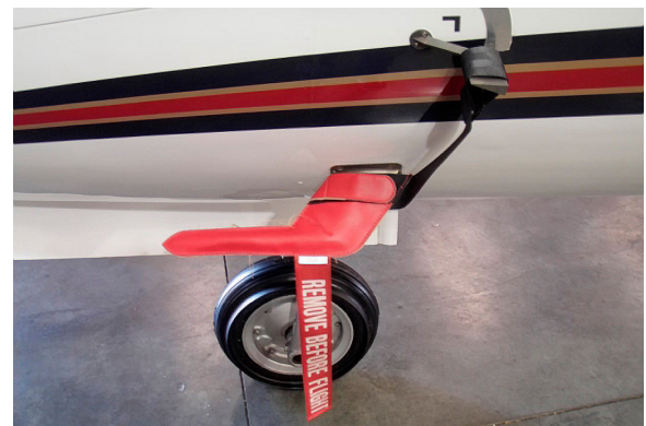
Learjet Heat Resistant Pitot Cover and AOA Strap