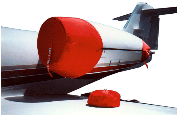
Lear 35 Engine Covers

The Lear 24 & 25 Bikini Style Engine Covers are a single-piece design using a soft and smooth stretchy and fabric. The cover stretches tightly over both the intake and exhaust, installing quickly and easily. These covers are designed to be used as hangar dust covers and have a useful life of approximately one year.