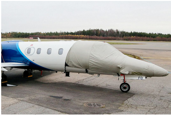
Learjet Cockpit/Nose Cover