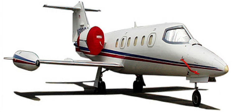
Lear 35 Engine Covers, Pitot Covers & Cockpit HeatShields