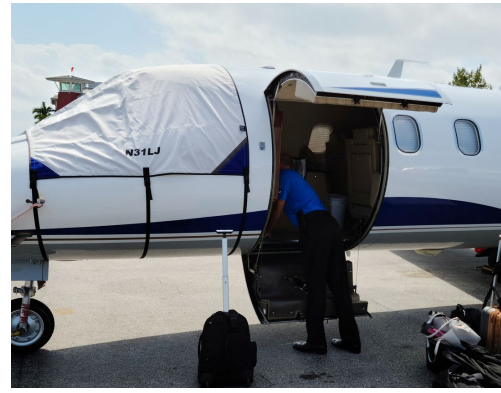
Lear 31A Cockpit Cover