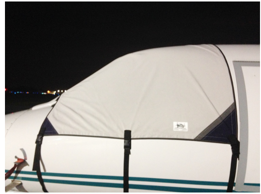
Lear 31 Cockpit Cover