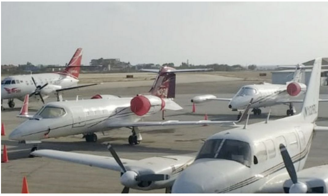
Engine Covers on a Lear 31