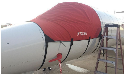
Learjet 45 Cockpit Cover