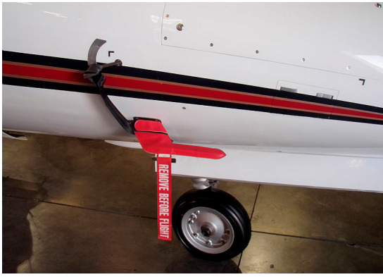
Learjet Heat Resistant Pitot Cover with AOA strap