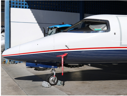
Lear Pitot Cover

The Engine Inlet Plugs are custom fit for your Lear Models 40 & 45 intakes, made with heavy-duty vinyl material, and stuffed with a single block of sculpted urethane foam. Each plug has a zipper that allows the foam to be removed and dried if necessary. Engine plugs have 'remove before flight' streamers sewn onto the face of the plugs. Most plugs are imprinted with the aircraft registration number in black for an extra charge. Storage bag NOT included. Engine plugs may be inserted after flight when the engine is still warm. Engine Inlet Plugs are commonly referred to as Cowl Plugs, Intake Plugs, Cowl Blocks, Engine Blocks, and Engine Bungs.