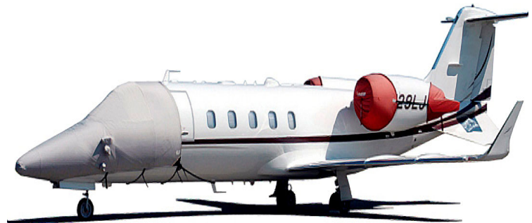
Lear 45 Windshield/Nose & Engine Cover Set