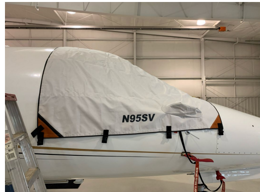
Lear 70 Cockpit Cover