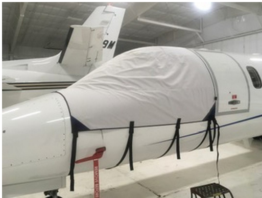
Lear 45 Cockpit Cover

This cover type is made from Silver Acrylic Sunbrella canvas and is 100% lined with a soft and smooth microfiber. Bruce's Custom Covers developed this material combination especially for aircraft protection. The outer material is medium weight and treated for water resistance, UV resistance and anti-static buildup. The inner lining is a very soft and smooth microfiber to prevent scratching. The material is very reflective, and tests show that the cabin interior temperature can be reduced to near-ambient temperature on the hottest of days. It is water, ice and snow repellent, yet breathable to allow moisture to escape from between the cover and the aircraft surface.