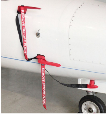
Lear 45 Pitot & Rosemont Cover Set

The Engine Inlet Plugs are custom fit for your Lear Models 40 & 45 intakes, made with heavy-duty vinyl material, and stuffed with a single block of sculpted urethane foam. Each plug has a zipper that allows the foam to be removed and dried if necessary. Engine plugs have 'remove before flight' streamers sewn onto the face of the plugs. Most plugs are imprinted with the aircraft registration number in black for an extra charge. Storage bag NOT included. Engine plugs may be inserted after flight when the engine is still warm. Engine Inlet Plugs are commonly referred to as Cowl Plugs, Intake Plugs, Cowl Blocks, Engine Blocks, and Engine Bungs.