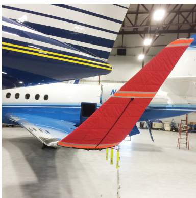
Falcon 2000 Winglet Pad