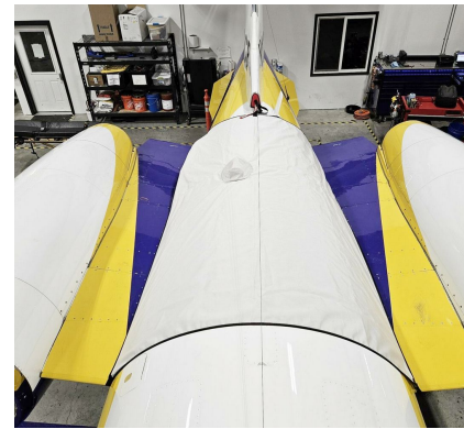
Lear 45 Empennage Saddle Cover W/ Dorsal Inlet Plug (Covers Upper Fuselage Between Pylons, Acm/Apu Area)