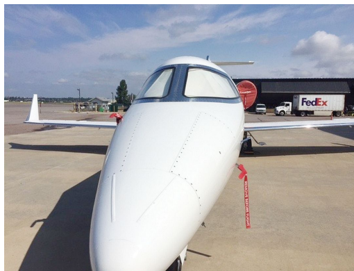
Lear Models 40 & 45 Cockpit Heatshields, Covers All Cockpit Windows