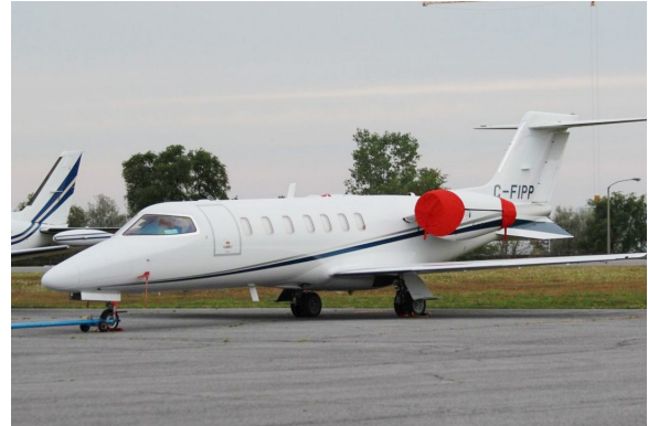
Lear 45 Engine Covers