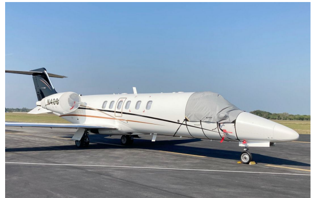
Lear 45 Light Weight Travel Cockpit Cover