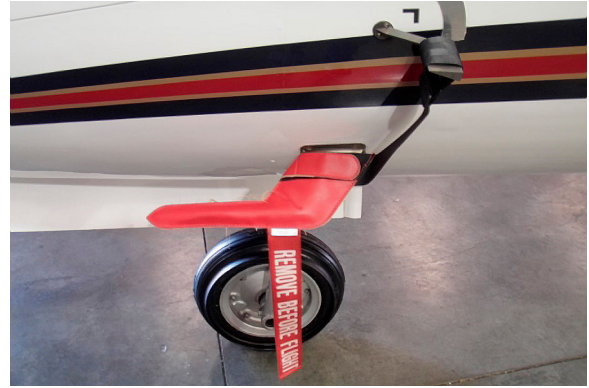
Learjet Heat Resistant Pitot Cover and AOA Strap