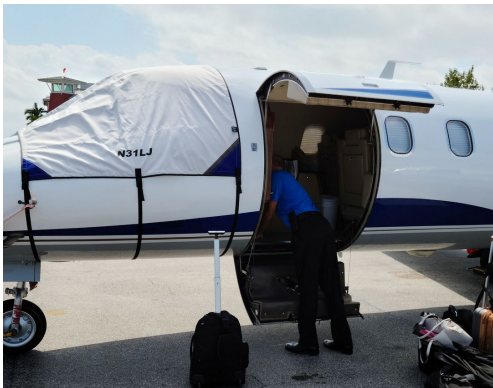
Lear 31A Cockpit Cover

This cover type is made from Silver Acrylic Sunbrella canvas and is 100% lined with a soft and smooth microfiber. Bruce's Custom Covers developed this material combination especially for aircraft protection. The outer material is medium weight and treated for water resistance, UV resistance and anti-static buildup. The inner lining is a very soft and smooth microfiber to prevent scratching. The material is very reflective, and tests show that the cabin interior temperature can be reduced to near-ambient temperature on the hottest of days. It is water, ice and snow repellent, yet breathable to allow moisture to escape from between the cover and the aircraft surface.