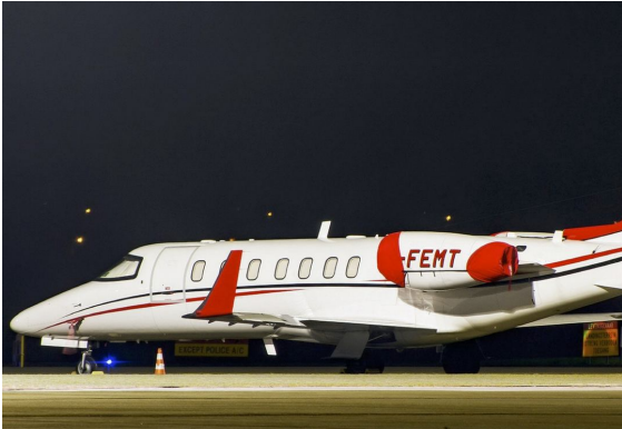
Lear 45 Engine Covers

The Lear Models 40 & 45 Bikini Style Engine Covers are a single-piece design using a soft and smooth stretchy and fabric. The cover stretches tightly over both the intake and exhaust, installing quickly and easily. These covers are designed to be used as hangar dust covers and have a useful life of approximately one year.