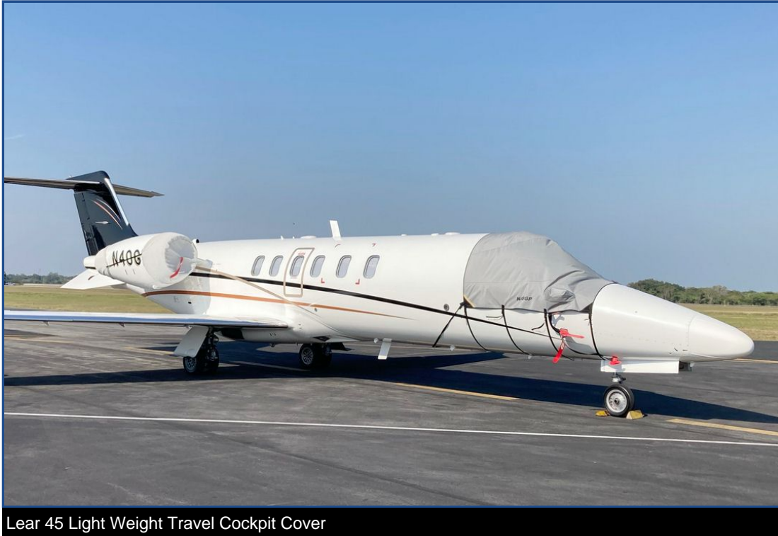
Lear 45 Light Weight Travel Cockpit Cover