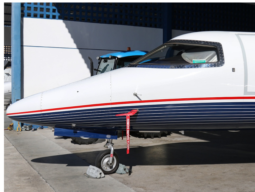
Lear Pitot Cover