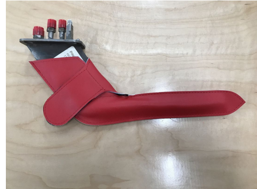
Lear 55 Pitot Cover