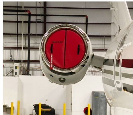
Embraer Legacy 500 Engine Inlet Plugs, folding type