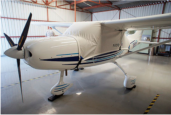
TL Ultralight Sirius Canopy Cover

This cover type is made from Silver Acrylic Sunbrella canvas and is 100% lined with a soft and smooth microfiber. Bruce's Custom Covers developed this material combination especially for aircraft protection. The outer material is medium weight and treated for water resistance, UV resistance and anti-static buildup. The inner lining is a very soft and smooth microfiber to prevent scratching. The material is very reflective, and tests show that the cabin interior temperature can be reduced to near-ambient temperature on the hottest of days. It is water, ice and snow repellent, yet breathable to allow moisture to escape from between the cover and the aircraft surface.