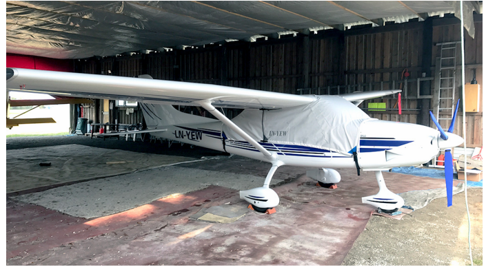
TL Ultralight Sirius TL-3000 Canopy Cover (Over-The-Top Style)