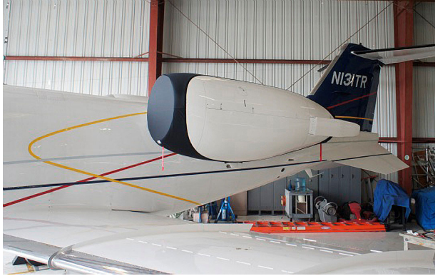
Lear 60 Engine Covers, "Bikini style"

The Lear Models 70 & 75 Bikini Style Engine Covers are a single-piece design using a soft and smooth stretchy and fabric. The cover stretches tightly over both the intake and exhaust, installing quickly and easily. These covers are designed to be used as hangar dust covers and have a useful life of approximately one year.