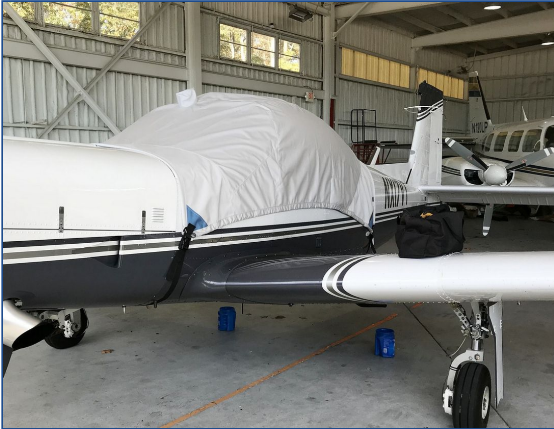
Valmet L-90 Canopy Cover