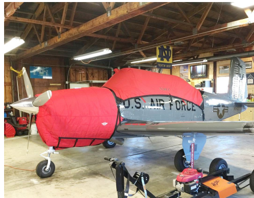
Beech T34 Mentor Canopy Cover, Insulated Engine Cover