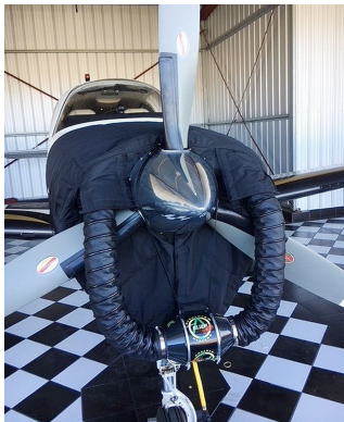
Beech Bonanza 36 Models Insulated Engine Cover

This cover type is made from Silver Acrylic Sunbrella canvas and is 100% lined with a soft and smooth microfiber. Bruce's Custom Covers developed this material combination especially for aircraft protection. The outer material is medium weight and treated for water resistance, UV resistance and anti-static buildup. The inner lining is a very soft and smooth microfiber to prevent scratching. The material is very reflective, and tests show that the cabin interior temperature can be reduced to near-ambient temperature on the hottest of days. It is water, ice and snow repellent, yet breathable to allow moisture to escape from between the cover and the aircraft surface.