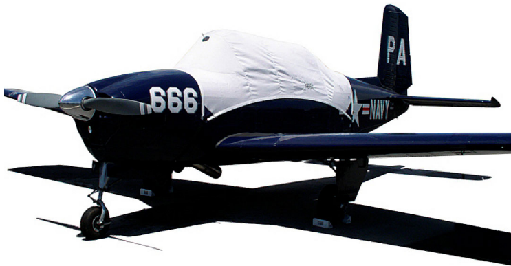
The T34 Canopy Cover

Travel Covers are made with Silver Solution-Dyed Polyester fabric and only lined over the windshield to save weight. The material is lightweight and more compact for easy stowage in the aircraft. The polyester material is water resistant, but only intended for occasional use outside. We also have an ultra lightweight material available for fitted hangar dust covers. For daily outdoor use, the non-travel Sunbrella Cover is the best choice.