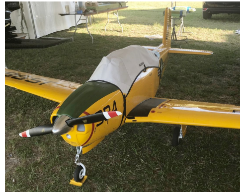
Beechcraft T-34B Mentor Canopy Cover, for 36% Scale Model