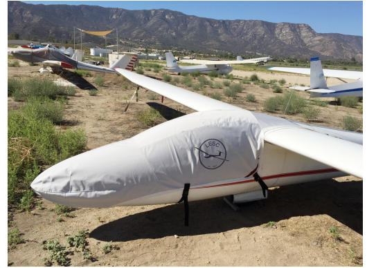
Pilatus B4 Canopy/Nose Cover