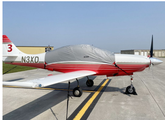
Lancair IV Travel Weight Canopy Cover