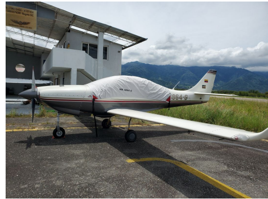
LANCAIR IV CANOPY COVER