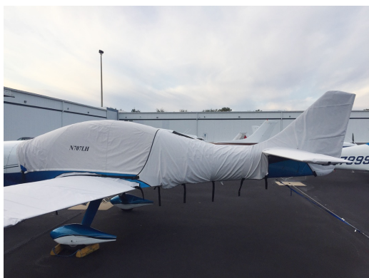
Lancair ES Wing Covers & Empennage Cover (sold separately)