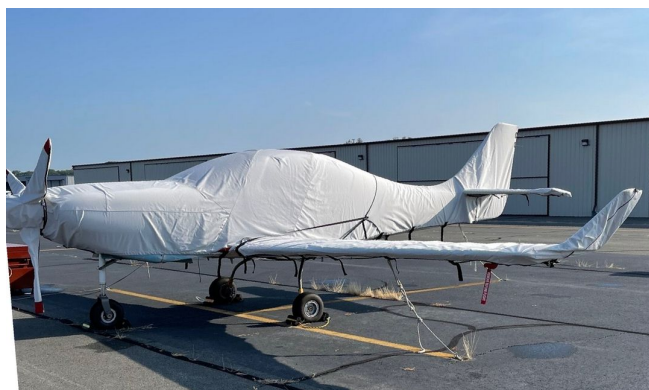
Lancair IV Complete Cover Set