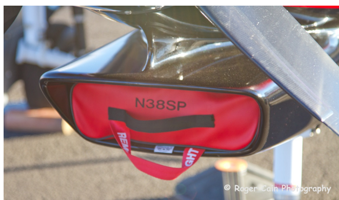
Lancair Evolution Engine Inlet Plug

Engine Inlet Plugs are custom fit for your Lancair IV, LX7 intakes, made with heavy-duty vinyl material, and stuffed with a single block of sculpted urethane foam. Each plug has a zipper that allows the foam to be removed and dried if necessary. Engine plugs have warning flags that are visible from the cockpit or 'remove before flight' streamers sewn onto the face of the plugs. Most plugs are imprinted with the aircraft registration number in black for an extra charge. Storage bag NOT included. Engine plugs may be inserted after flight when the engine is still warm. Engine Inlet Plugs are commonly referred to as Cowl Plugs, Intake Plugs, Cowl Blocks, Engine Blocks, and Engine Bungs.