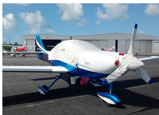
Lancair Canopy Cover, Plugs & Prop Cover