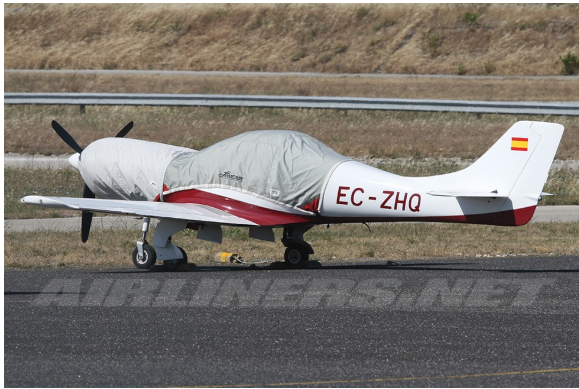
Lancair 360 Canopy Cover, Engine Cover

This cover type is made from Silver Acrylic Sunbrella canvas and is 100% lined with a soft and smooth microfiber. Bruce's Custom Covers developed this material combination especially for aircraft protection. The outer material is medium weight and treated for water resistance, UV resistance and anti-static buildup. The inner lining is a very soft and smooth microfiber to prevent scratching. The material is very reflective, and tests show that the cabin interior temperature can be reduced to near-ambient temperature on the hottest of days. It is water, ice and snow repellent, yet breathable to allow moisture to escape from between the cover and the aircraft surface.