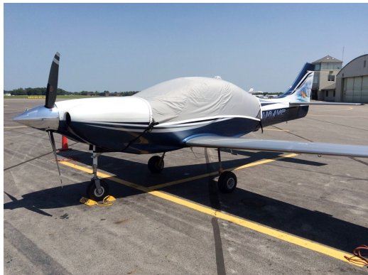
Lancair IV Light Weight Travel Canopy Cover

Travel Covers are made with Silver Solution-Dyed Polyester fabric and only lined over the windshield to save weight. The material is lightweight and more compact for easy stowage in the aircraft. The polyester material is water resistant, but only intended for occasional use outside. We also have an ultra lightweight material available for fitted hangar dust covers. For daily outdoor use, the non-travel Sunbrella Cover is the best choice.