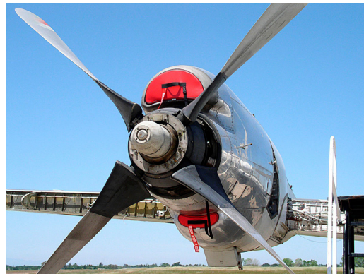
Lockheed P-3 Main Engine Inlet Plugs