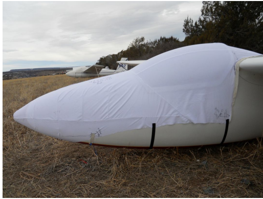
Laister LP-49 Canopy/Nose Cover, test fit cover

water resistance, UV resistance and anti-static buildup. The inner lining is a very soft and smooth microfiber to prevent scratching. The material is very reflective, and tests show that the cabin interior temperature can be reduced to near-ambient temperature on the hottest of days. It is water, ice and snow repellent, yet breathable to allow moisture to escape from between the cover and the aircraft surface.