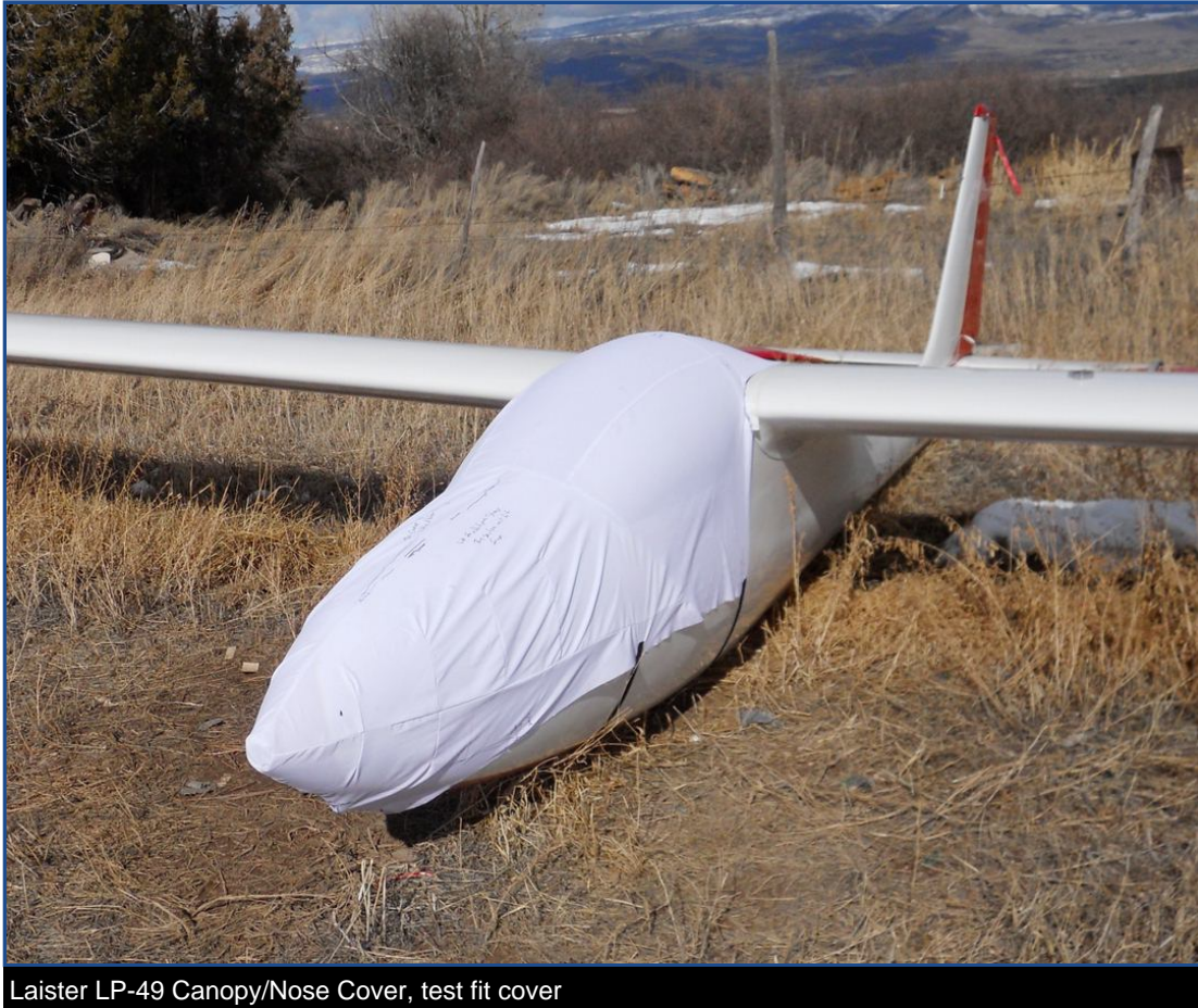
Laister LP-49 Canopy/Nose Cover, test fit cover