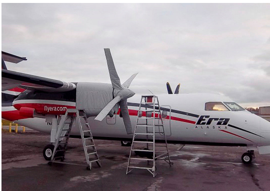
Dash 8 Insulated Engine & Prop Covers

This cover type is made from Silver Acrylic Sunbrella canvas and is 100% lined with a soft and smooth microfiber. Bruce's Custom Covers developed this material combination especially for aircraft protection. The outer material is medium weight and treated for water resistance, UV resistance and anti-static buildup. The inner lining is a very soft and smooth microfiber to prevent scratching. The material is very reflective, and tests show that the cabin interior temperature can be reduced to near-ambient temperature on the hottest of days. It is water, ice and snow repellent, yet breathable to allow moisture to escape from between the cover and the aircraft surface.