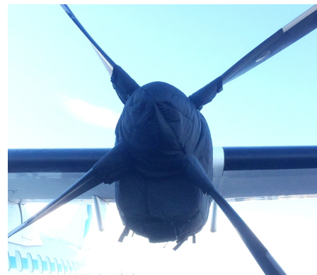
ATR-72-202 Insulated Engine & Prop Hub Covers