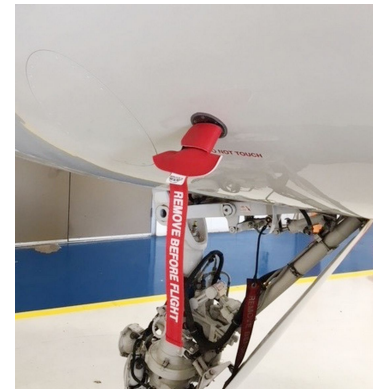
Grumman Gulfstream G-V Rosemont/TAT Cover