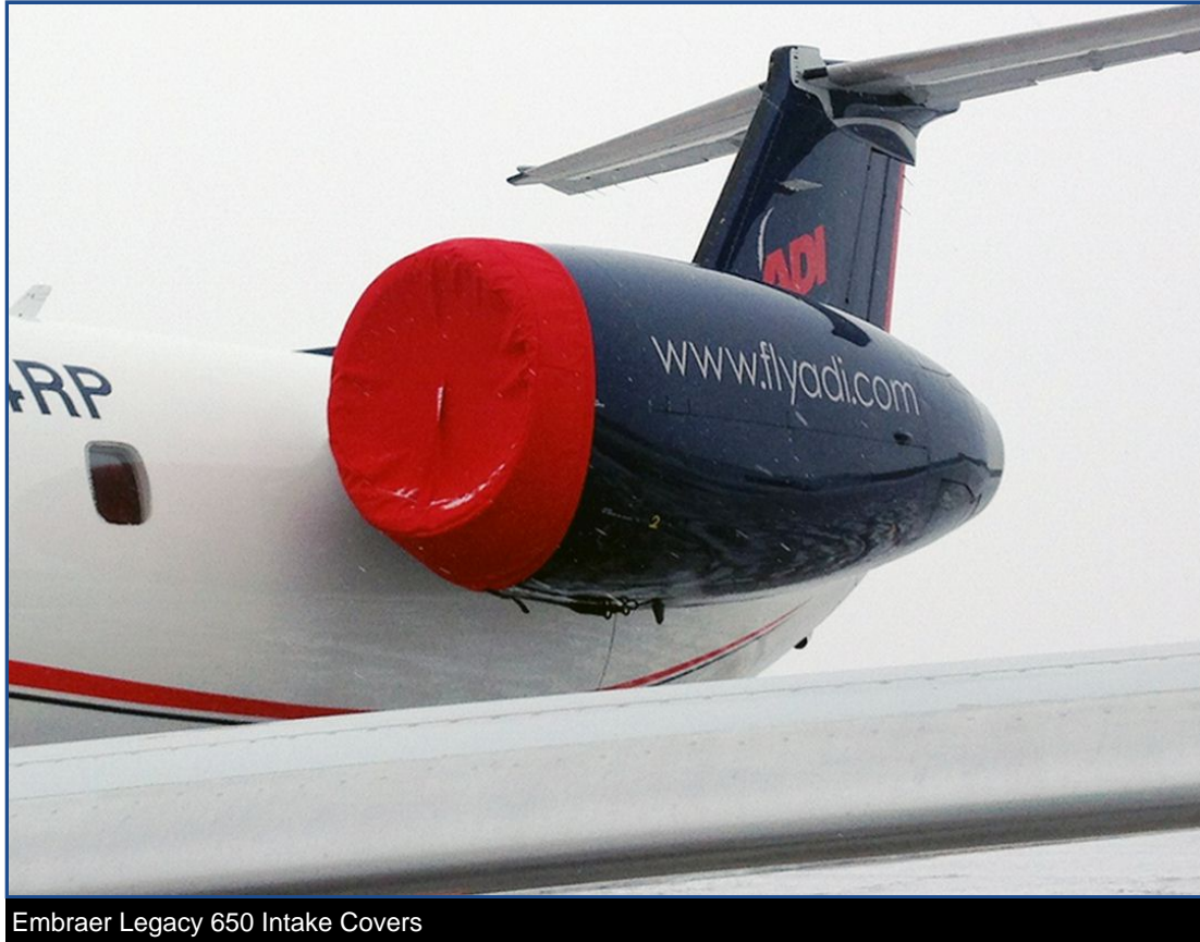
Embraer Legacy 650 Intake Covers