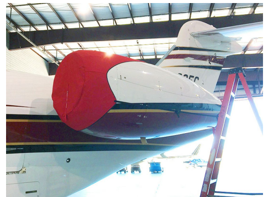
Canadair Challenger 300 Intake/Exhaust Covers, 3-Strap Type