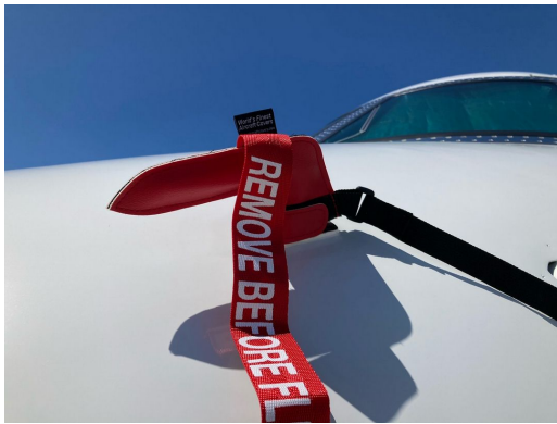
Embraer ERJ-135 Pitot/TAT/Ice Detector Covers

The Engine Inlet Plugs are custom fit for your Embraer ERJ-135/140/145 Legacy 600, 650 intakes, made with heavy-duty vinyl material, and stuffed with a single block of sculpted urethane foam. Each plug has a zipper that allows the foam to be removed and dried if necessary. Engine plugs have 'remove before flight' streamers sewn onto the face of the plugs. Most plugs are imprinted with the aircraft registration number in black for an extra charge. Storage bag NOT included. Engine plugs may be inserted after flight when the engine is still warm. Engine Inlet Plugs are commonly referred to as Cowl Plugs, Intake Plugs, Cowl Blocks, Engine Blocks, and Engine Bungs.