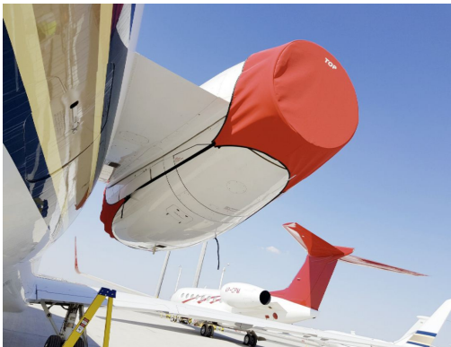
Embraer ERJ-135/140/145 Legacy 650 3-Strap Intake/Exhaust Cover

The Embraer ERJ-135/140/145 Legacy 600, 650 Intake Covers are designed to install easily yet be completely storable. A spring steel hoop is sewn into the hem of each cover, allowing them to be installed without climbing onto the wing or using a stepladder. To store the covers the spring steel hoop folds like a band-saw blade into three nesting rings. Each cover folds into a compact circular bundle which is stored in the included duffle bag, yet they unfold quickly for use. The Tri-Fold Ring cover is made of medium weight nylon which is available in a variety of colors to match the paint trim. Each cover set comes complete with installation and folding instructions. The aircraft's registration number can be silkscreened onto the cover for an extra charge.