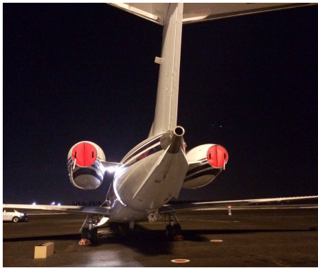
Embraer Legacy Exhaust Plugs

The Engine Inlet Plugs are custom fit for your Embraer ERJ-135/140/145 Legacy 600, 650 intakes, made with heavy-duty vinyl material, and stuffed with a single block of sculpted urethane foam. Each plug has a zipper that allows the foam to be removed and dried if necessary. Engine plugs have 'remove before flight' streamers sewn onto the face of the plugs. Most plugs are imprinted with the aircraft registration number in black for an extra charge. Storage bag NOT included. Engine plugs may be inserted after flight when the engine is still warm. Engine Inlet Plugs are commonly referred to as Cowl Plugs, Intake Plugs, Cowl Blocks, Engine Blocks, and Engine Bungs.