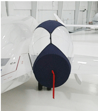
Challenger 300 Intake/Exhaust Cover Set, 3-strap type

The Embraer ERJ-135/140/145 Legacy 600, 650 Intake Covers are designed to install easily yet be completely storable. A spring steel hoop is sewn into the hem of each cover, allowing them to be installed without climbing onto the wing or using a stepladder. To store the covers the spring steel hoop folds like a band-saw blade into three nesting rings. Each cover folds into a compact circular bundle which is stored in the included duffle bag, yet they unfold quickly for use. The Tri-Fold Ring cover is made of medium weight nylon which is available in a variety of colors to match the paint trim. Each cover set comes complete with installation and folding instructions. The aircraft's registration number can be silkscreened onto the cover for an extra charge.