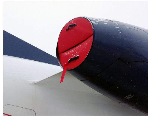
Embraer Legacy 650 Exhaust Plug