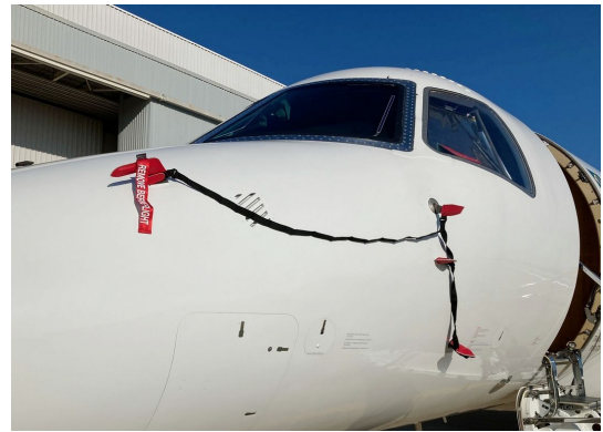
Embraer ERJ-135 Pitot/TAT/Ice Detector Covers