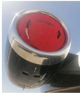
Embraer ERJ-135/140/145 Legacy 600, 650, Praetor Intake/Exhaust Plugs, Non-Folding Type

The Engine Inlet Plugs are custom fit for your Embraer ERJ-135/140/145 Legacy 600, 650 intakes, made with heavy-duty vinyl material, and stuffed with a single block of sculpted urethane foam. Each plug has a zipper that allows the foam to be removed and dried if necessary. Engine plugs have 'remove before flight' streamers sewn onto the face of the plugs. Most plugs are imprinted with the aircraft registration number in black for an extra charge. Storage bag NOT included. Engine plugs may be inserted after flight when the engine is still warm. Engine Inlet Plugs are commonly referred to as Cowl Plugs, Intake Plugs, Cowl Blocks, Engine Blocks, and Engine Bungs.