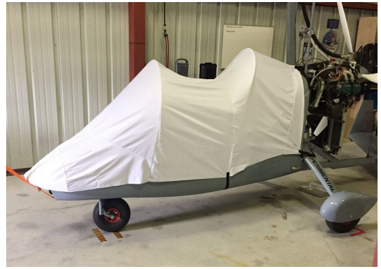
Magni M16 Autogyro Canopy/Nose Cover, test fit cover