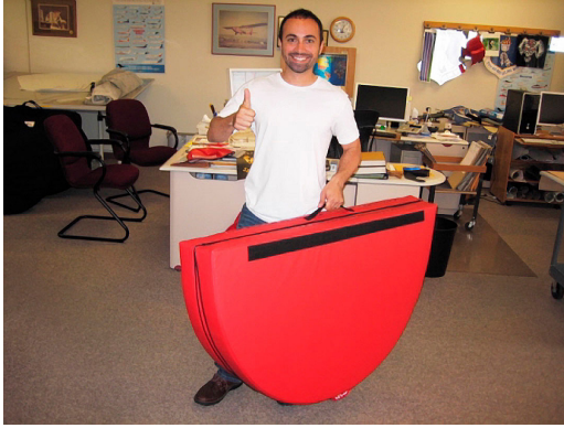
Boeing 737 FOD protection Intake Plug, folding type

ALL-YEAR USE MATERIAL - Made with Silver Acrylic Sunbrella canvas, the all-year use material is the best option for sun protection and cover longevity. This heavier more durable material is intended for all weather conditions, such as rain and snow or lots of sun.