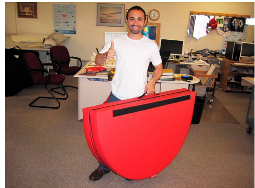
Boeing 737 FOD protection Intake Plug, folding type