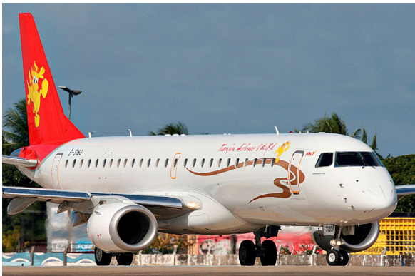
Covers, Plugs & HeatShields for Embraer 170/175/190/195

The Engine Inlet Plugs are custom fit for your Embraer EMB-170/175 intakes, made with heavy-duty vinyl material, and stuffed with a single block of sculpted urethane foam. Each plug has a zipper that allows the foam to be removed and dried if necessary. Engine plugs have 'remove before flight' streamers sewn onto the face of the plugs. Most plugs are imprinted with the aircraft registration number in black for an extra charge. Storage bag NOT included. Engine plugs may be inserted after flight when the engine is still warm. Engine Inlet Plugs are commonly referred to as Cowl Plugs, Intake Plugs, Cowl Blocks, Engine Blocks, and Engine Bungs.