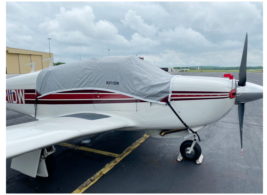
Mooney M20F Travel Weight Canopy Cover