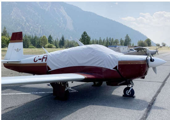
Mooney M20E Canopy Cover with Forward Extension

This cover type is made from Silver Acrylic Sunbrella canvas and is 100% lined with a soft and smooth microfiber. Bruce's Custom Covers developed this material combination especially for aircraft protection. The outer material is medium weight and treated for water resistance, UV resistance and anti-static buildup. The inner lining is a very soft and smooth microfiber to prevent scratching. The material is very reflective, and tests show that the cabin interior temperature can be reduced to near-ambient temperature on the hottest of days. It is water, ice and snow repellent, yet breathable to allow moisture to escape from between the cover and the aircraft surface.