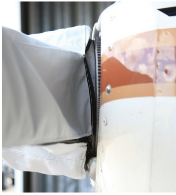
Mooney Early M20 Series Propellor/Spinner Cover, 2 Blade