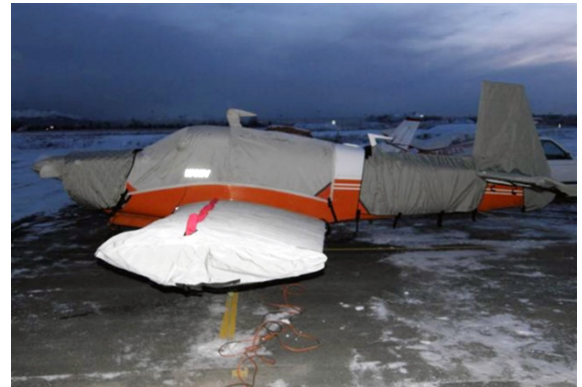
Mooney 201 Empennage Cover