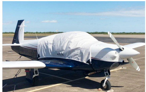
Mooney M20F Canopy Cover with forward extension