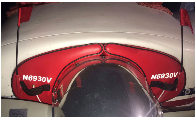
Mooney M20C Engine Inlet Plugs, LASAR mod (Cowl Enclosure Fairing (set of 2)