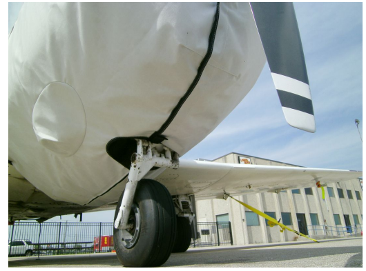
Mooney M20C Fully Enclosed Engine Cover