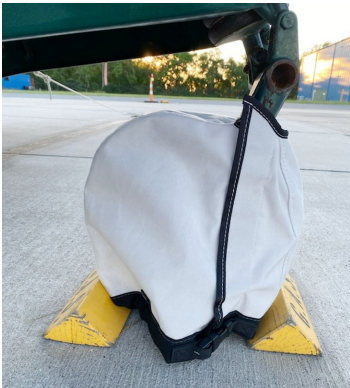
Mooney 201 Nose Wheel Cover

ALL-YEAR USE MATERIAL - Made with Silver Acrylic Sunbrella canvas, the all-year use material is the best option for sun protection and cover longevity. This heavier more durable material is intended for all weather conditions, such as rain and snow or lots of sun.