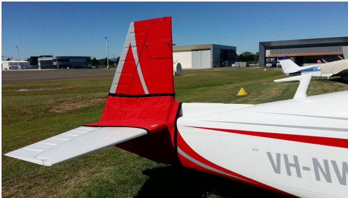
Mooney M20J Tailcone Cover

WINTER USE MATERIAL - Made with Solution-Dyed Polyester fabric, this option is intended for seasonal use to aid in deicing, rain mitigation, or for occasional travel. The material is lighter and more compact, but more susceptible to UV damage and may have a shorter useful life if used continuously outside than the all-year use material.