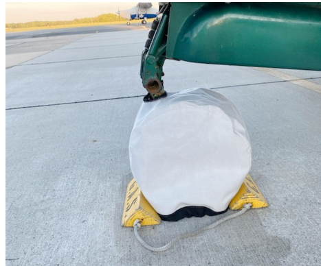
Mooney 201 Nose Wheel Cover