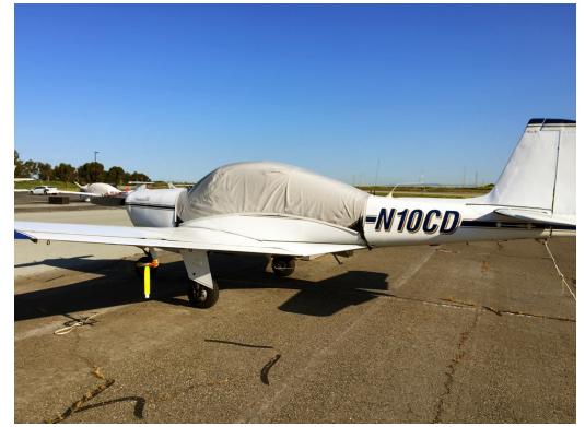
Meyer (Aero Commander) 200 Canopy Cover