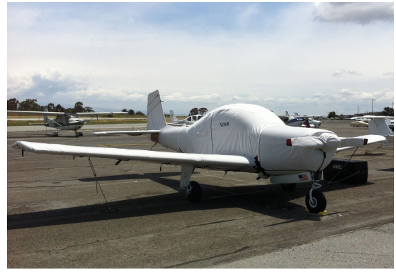
Meyers 200 Complete Cover Set