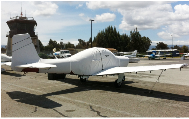
Meyers 200 Complete Cover Set