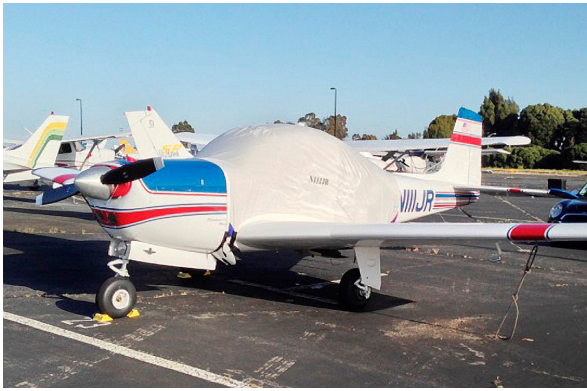
Meyers 200 Extended Canopy Cover & Engine Plugs