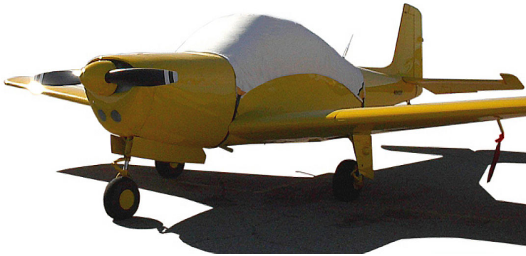
Meyer (Aero Commander) 200 Canopy Cover