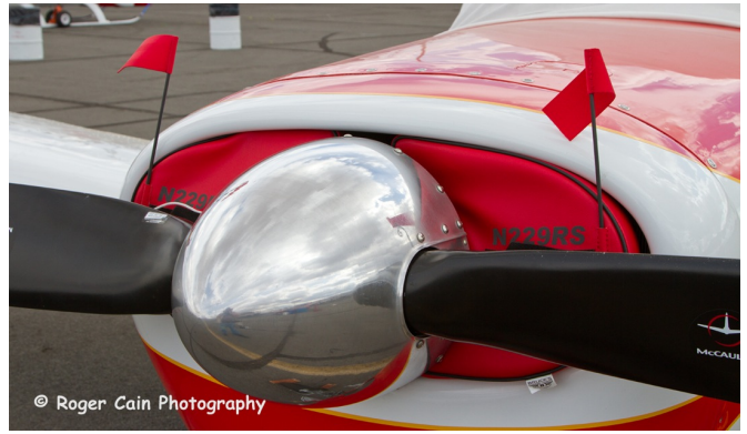
Meyer (Aero Commander) 200 Engine Plugs