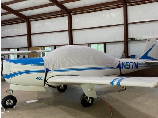
Meyers (Rockwell) 200 Canopy Cover

This cover type is made from Silver Acrylic Sunbrella canvas and is 100% lined with a soft and smooth microfiber. Bruce's Custom Covers developed this material combination especially for aircraft protection. The outer material is medium weight and treated for water resistance, UV resistance and anti-static buildup. The inner lining is a very soft and smooth microfiber to prevent scratching. The material is very reflective, and tests show that the cabin interior temperature can be reduced to near-ambient temperature on the hottest of days. It is water, ice and snow repellent, yet breathable to allow moisture to escape from between the cover and the aircraft surface.