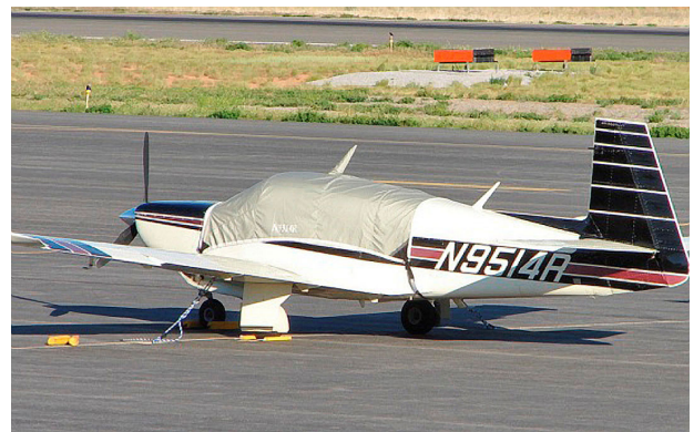
Mooney 201 Canopy Cover