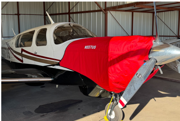
Mooney M20M, Insulated Engine Cover, doesn't cover gear well

This cover type is made from Silver Acrylic Sunbrella canvas and is 100% lined with a soft and smooth microfiber. Bruce's Custom Covers developed this material combination especially for aircraft protection. The outer material is medium weight and treated for water resistance, UV resistance and anti-static buildup. The inner lining is a very soft and smooth microfiber to prevent scratching. The material is very reflective, and tests show that the cabin interior temperature can be reduced to near-ambient temperature on the hottest of days. It is water, ice and snow repellent, yet breathable to allow moisture to escape from between the cover and the aircraft surface.