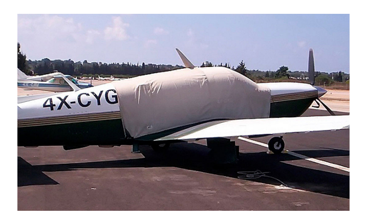
Mooney M20 Extended Canopy Cover