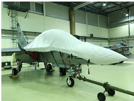
Alenia Aermacchi M-346 Canopy/Nose Cover

This cover type is made from Silver Acrylic Sunbrella canvas and is 100% lined with a soft and smooth microfiber. Bruce's Custom Covers developed this material combination especially for aircraft protection. The outer material is medium weight and treated for water resistance, UV resistance and anti-static buildup. The inner lining is a very soft and smooth microfiber to prevent scratching. The material is very reflective, and tests show that the cabin interior temperature can be reduced to near-ambient temperature on the hottest of days. It is water, ice and snow repellent, yet breathable to allow moisture to escape from between the cover and the aircraft surface.