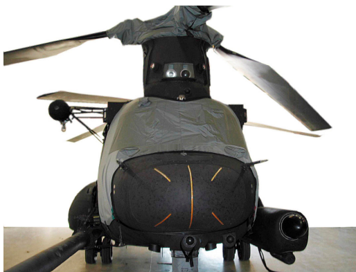
Boeing Vertol CH-47 Forward Cabin & Rotor Hub Cover

Insulated Covers Material - A special composite material of solution-dyed polyester, 3M Thinsulate insulation, and soft nylon interior fabric. Our insulated covers are designed to complement an engine preheater and help retain heat in the engine compartment after shutdown. If you operate your aircraft in cold-weather, these covers will help prevent engine wear and tear.