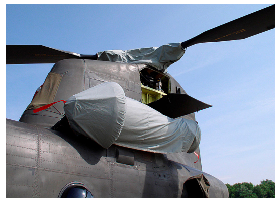
Boeing Vertol CH-47 Engine and Rotor Hub Covers