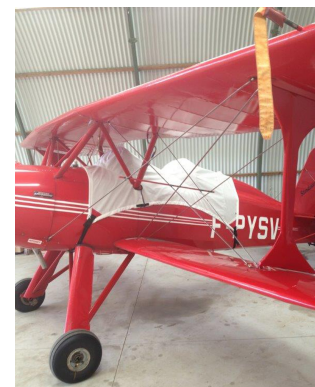
Starduster Too Canopy Cover