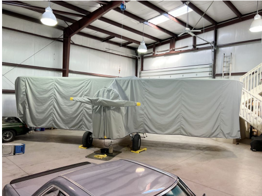
Stearman PT-13 Full Body Dust Cover

Some high value aircraft end up logging lots of hangar time, and become dust magnets in the process. A high quality, well fitting dust cover provides easy assurance that the aircraft's surfaces remain clean and free of grit and grime. Available in a large variety of colors, each dust cover is custom made according to aircraft details and customer preferences. Fire retardant fabrics are also available.