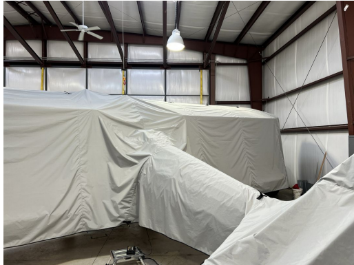
Stearman PT-13 Full Body Dust Cover, Prop Cover Included

Some high value aircraft end up logging lots of hangar time, and become dust magnets in the process. A high quality, well fitting dust cover provides easy assurance that the aircraft's surfaces remain clean and free of grit and grime. Available in a large variety of colors, each dust cover is custom made according to aircraft details and customer preferences. Fire retardant fabrics are also available.