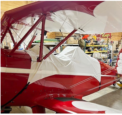
Marquardt Charger MA-5 Cockpit Cover