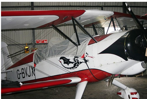
Marquardt Charger MA-5 Light Weight Travel Cockpit Cover

This cover type is made from Silver Acrylic Sunbrella canvas and is 100% lined with a soft and smooth microfiber. Bruce's Custom Covers developed this material combination especially for aircraft protection. The outer material is medium weight and treated for water resistance, UV resistance and anti-static buildup. The inner lining is a very soft and smooth microfiber to prevent scratching. The material is very reflective, and tests show that the cabin interior temperature can be reduced to near-ambient temperature on the hottest of days. It is water, ice and snow repellent, yet breathable to allow moisture to escape from between the cover and the aircraft surface.