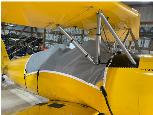
Marquardt Charger Travel Weight Canopy Cover

This cover type is made from Silver Acrylic Sunbrella canvas and is 100% lined with a soft and smooth microfiber. Bruce's Custom Covers developed this material combination especially for aircraft protection. The outer material is medium weight and treated for water resistance, UV resistance and anti-static buildup. The inner lining is a very soft and smooth microfiber to prevent scratching. The material is very reflective, and tests show that the cabin interior temperature can be reduced to near-ambient temperature on the hottest of days. It is water, ice and snow repellent, yet breathable to allow moisture to escape from between the cover and the aircraft surface.