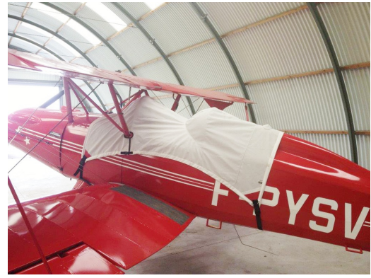
Starduster Too Canopy Cover