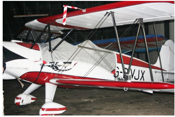
Marquardt Charger MA-5 Canopy Cover