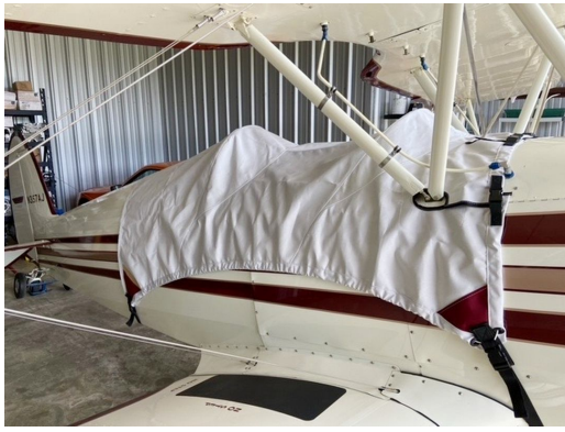
Marquardt Charger Cockpit Cover