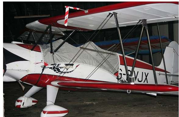
Marquardt Charger MA-5 Light Weight Travel Cockpit Cover