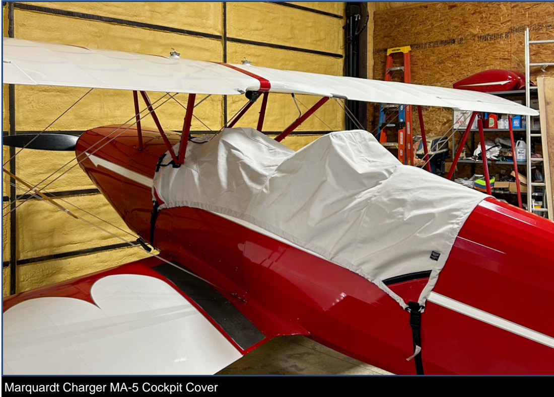
Marquardt Charger MA-5 Cockpit Cover