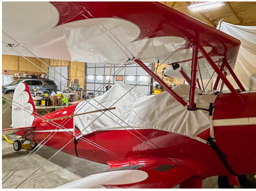
Marquardt Charger MA-5 Cockpit Cover