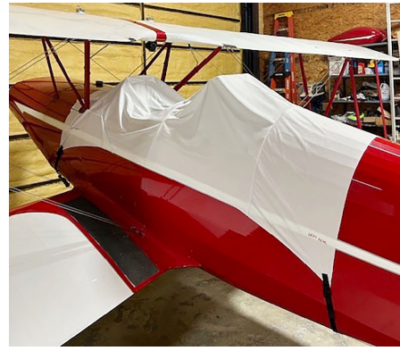
Marquardt Charger MA-5 Cockpit Cover