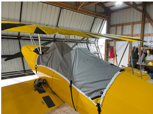
Marquardt Charger Travel Weight Canopy Cover

This cover type is made from Silver Acrylic Sunbrella canvas and is 100% lined with a soft and smooth microfiber. Bruce's Custom Covers developed this material combination especially for aircraft protection. The outer material is medium weight and treated for water resistance, UV resistance and anti-static buildup. The inner lining is a very soft and smooth microfiber to prevent scratching. The material is very reflective, and tests show that the cabin interior temperature can be reduced to near-ambient temperature on the hottest of days. It is water, ice and snow repellent, yet breathable to allow moisture to escape from between the cover and the aircraft surface.