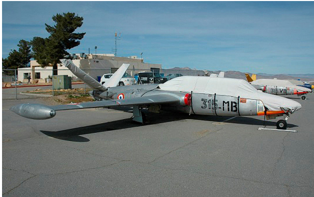
Fouga Magister Canopy/Nose Cover & Tail Stabilizer Covers

Travel Covers are made with Silver Solution-Dyed Polyester fabric and only lined over the windshield to save weight. The material is lightweight and more compact for easy stowage in the aircraft. The polyester material is water resistant, but only intended for occasional use outside. We also have an ultra lightweight material available for fitted hangar dust covers. For daily outdoor use, the non-travel Sunbrella Cover is the best choice.