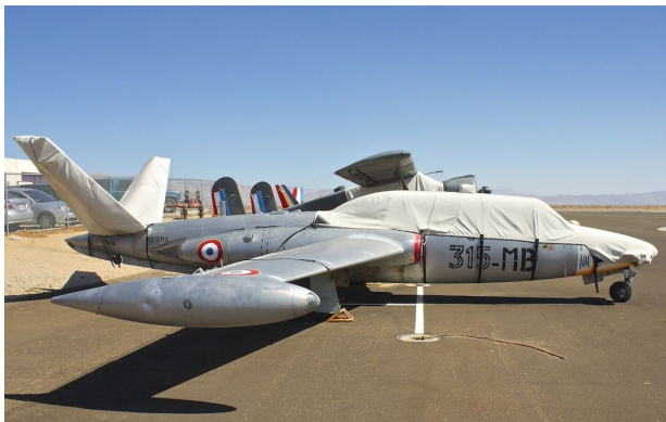
Fougas Magister Canopy/Nose Cover, Tail Stabilizer Covers

WINTER USE MATERIAL - Made with Solution-Dyed Polyester fabric, this option is intended for seasonal use to aid in deicing, rain mitigation, or for occasional travel. The material is lighter and more compact, but more susceptible to UV damage and may have a shorter useful life if used continuously outside than the all-year use material.