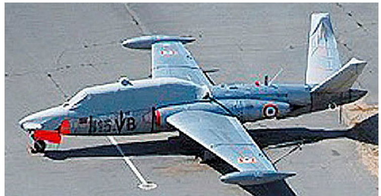
Fougas Magister Canopy/Nose & Stabilizer Covers