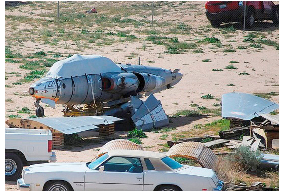
Fouga Magister Canopy Cover