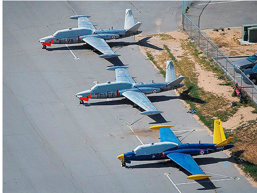
Fouga Magister Canopy Cover, Canopy/Nose Covers and Tail Stabilizer Covers

This cover type is made from Silver Acrylic Sunbrella canvas and is 100% lined with a soft and smooth microfiber. Bruce's Custom Covers developed this material combination especially for aircraft protection. The outer material is medium weight and treated for water resistance, UV resistance and anti-static buildup. The inner lining is a very soft and smooth microfiber to prevent scratching. The material is very reflective, and tests show that the cabin interior temperature can be reduced to near-ambient temperature on the hottest of days. It is water, ice and snow repellent, yet breathable to allow moisture to escape from between the cover and the aircraft surface.