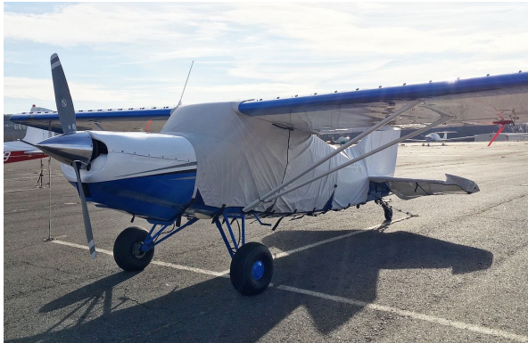
Maule M-5-235C Extended Canopy Cover, Empennage Cover

WINTER USE MATERIAL - Made with Solution-Dyed Polyester fabric, this option is intended for seasonal use to aid in deicing, rain mitigation, or for occasional travel. The material is lighter and more compact, but more susceptible to UV damage and may have a shorter useful life if used continuously outside than the all-year use material.