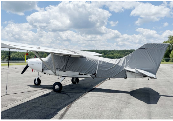
Maule MXT-7-180 Canopy & Empennage Covers, travel weight