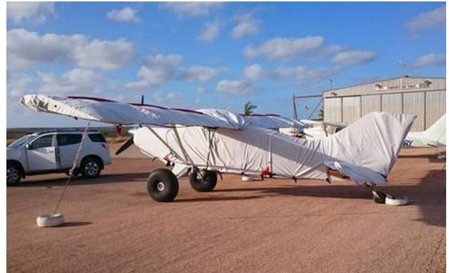
Maule M7-235 Extended Canopy, Wing, Engine & Empennage Covers