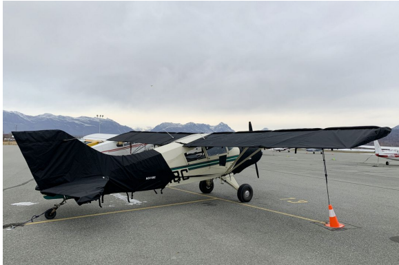
Maule Insulated Engine Cover, Wing & Empennage Covers

This cover type is made from Silver Acrylic Sunbrella canvas and is 100% lined with a soft and smooth microfiber. Bruce's Custom Covers developed this material combination especially for aircraft protection. The outer material is medium weight and treated for water resistance, UV resistance and anti-static buildup. The inner lining is a very soft and smooth microfiber to prevent scratching. The material is very reflective, and tests show that the cabin interior temperature can be reduced to near-ambient temperature on the hottest of days. It is water, ice and snow repellent, yet breathable to allow moisture to escape from between the cover and the aircraft surface.