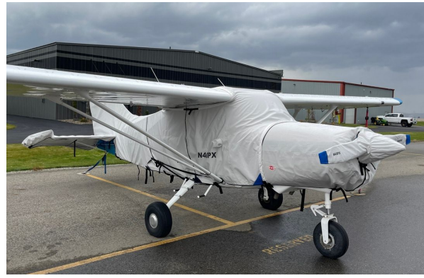
Maule M7-180 Full Body Over-Top Fuselage/Tail Cover Maule MX7-180 Prop, Engine, Extended Canopy & Empennage Covers