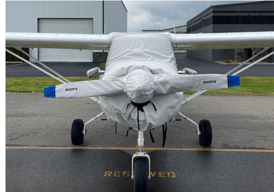
Maule MX7-180 Prop, Engine, Extended Canopy & Empennage Covers