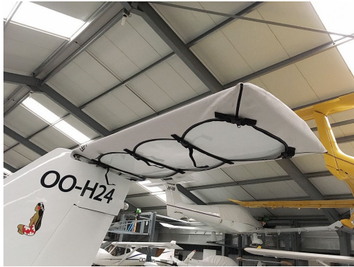
Dynaero MCR Horizontal Stabilizer Cover

WINTER USE MATERIAL - Made with Solution-Dyed Polyester fabric, this option is intended for seasonal use to aid in deicing, rain mitigation, or for occasional travel. The material is lighter and more compact, but more susceptible to UV damage and may have a shorter useful life if used continuously outside than the all-year use material.