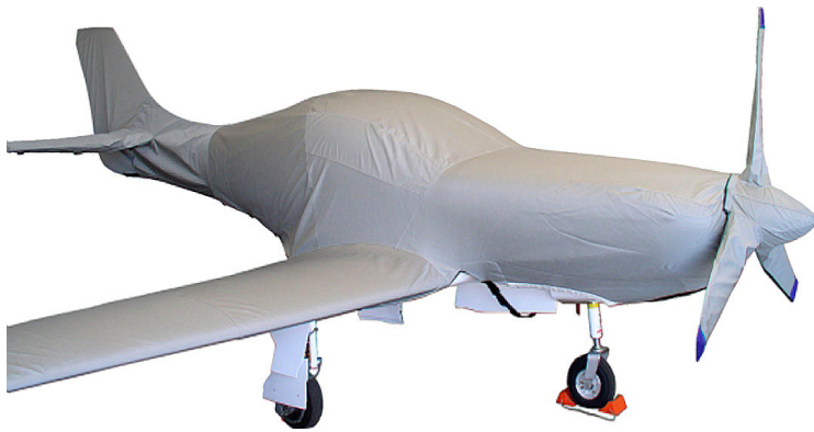
Lancair 320 Complete Fuselage/Wing Cover & Prop Cover

This cover type is made from Silver Acrylic Sunbrella canvas and is 100% lined with a soft and smooth microfiber. Bruce's Custom Covers developed this material combination especially for aircraft protection. The outer material is medium weight and treated for water resistance, UV resistance and anti-static buildup. The inner lining is a very soft and smooth microfiber to prevent scratching. The material is very reflective, and tests show that the cabin interior temperature can be reduced to near-ambient temperature on the hottest of days. It is water, ice and snow repellent, yet breathable to allow moisture to escape from between the cover and the aircraft surface.