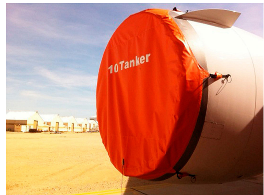
DC-10-30 Intake Cover (CF650C2 Engine)