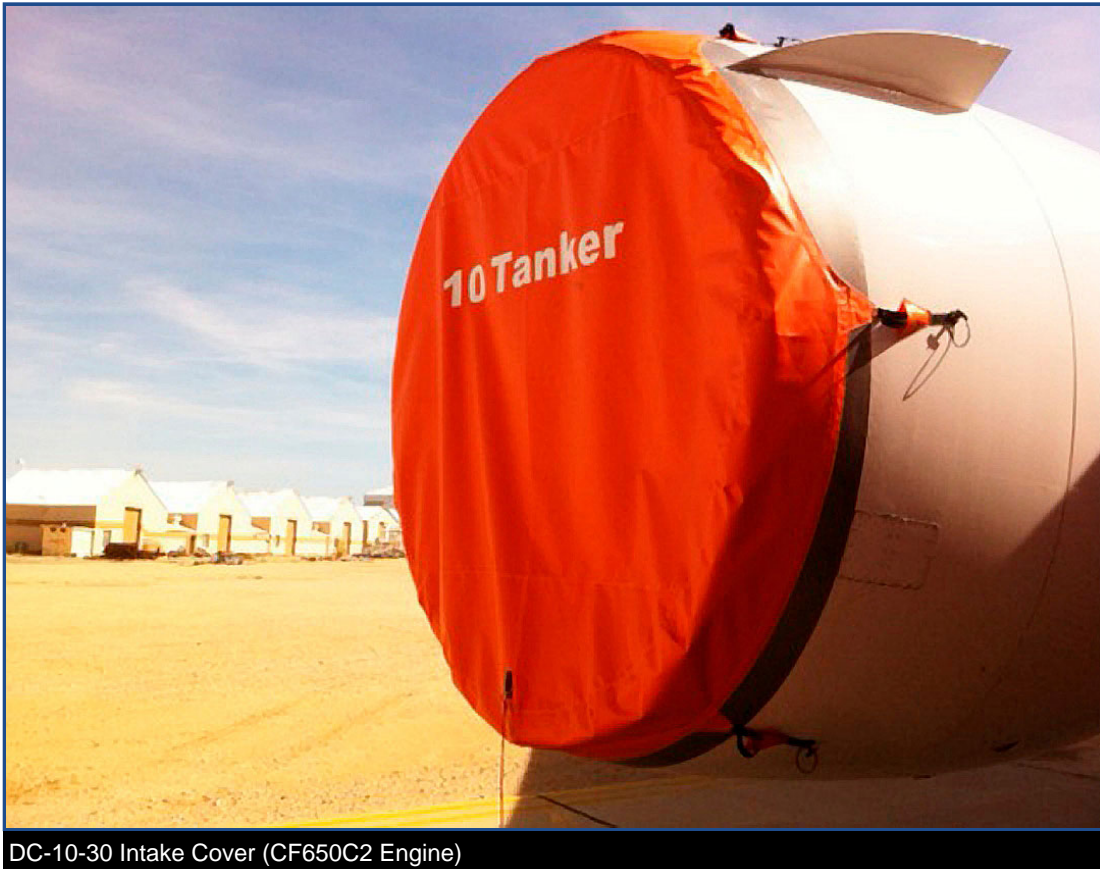
DC-10-30 Intake Cover (CF650C2 Engine)