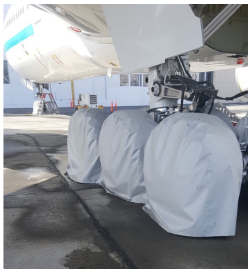
Boeing 777 Main & Nose Gear Tire Covers

ALL-YEAR USE MATERIAL - Made with Silver Acrylic Sunbrella canvas, the all-year use material is the best option for sun protection and cover longevity. This heavier more durable material is intended for all weather conditions, such as rain and snow or lots of sun.