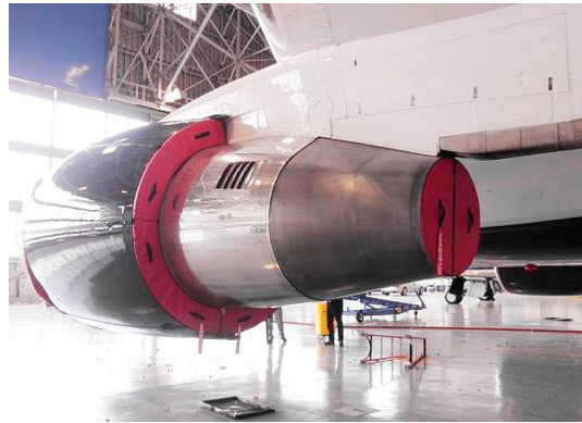
DC-10 Bypass Vent, Exhaust Plug set Exhaust Plugs Ship Set, incl. Fan Thrust Reverser and Exhaust Plugs P/N: B767-200