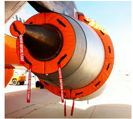
Exhaust Plugs Ship Set, incl. Fan Thrust Reverser and Exhaust Plugs P/N: B767-200 DC-10 Bypass Vent, Exhaust Plug set