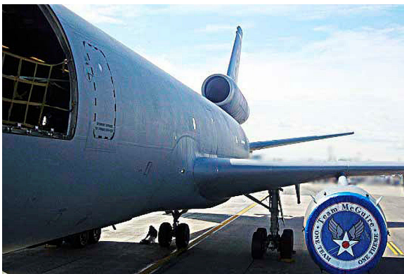
KC-10 Intake Cover at McGuire AFB, NJ