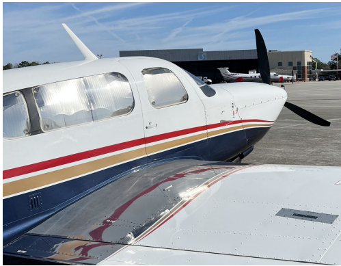
Mooney M20S Heatshield Set

Heatshields are interior sunshades for an aircraft's windows or canopy glass. The product is a unique composite of closed-cell foam with a silver mylar finish. The semi-rigid design is stiff enough to stand along the inside of the windshield using sun visors or window framing. It folds up flat and easily stores in the included storage sleeve. Some designs may require velcro and suction cups. A Heatshield is an excellent short-term remedy for cockpit overheating.