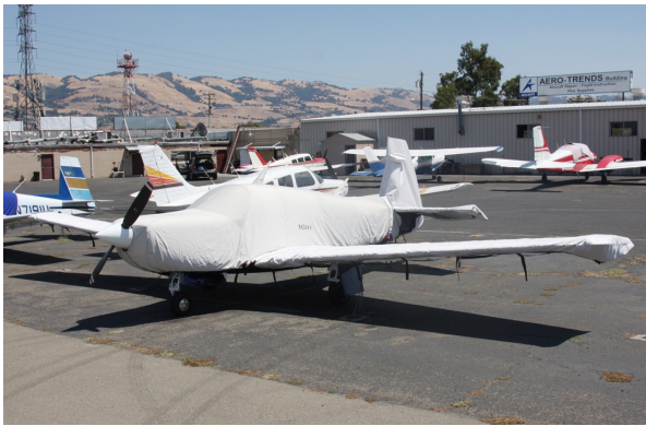
Mooney 231 Full Cover Set

This cover type is made from Silver Acrylic Sunbrella canvas and is 100% lined with a soft and smooth microfiber. Bruce's Custom Covers developed this material combination especially for aircraft protection. The outer material is medium weight and treated for water resistance, UV resistance and anti-static buildup. The inner lining is a very soft and smooth microfiber to prevent scratching. The material is very reflective, and tests show that the cabin interior temperature can be reduced to near-ambient temperature on the hottest of days. It is water, ice and snow repellent, yet breathable to allow moisture to escape from between the cover and the aircraft surface.