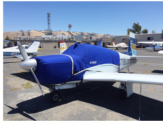
Mooney M20 Canopy & Engine Cover