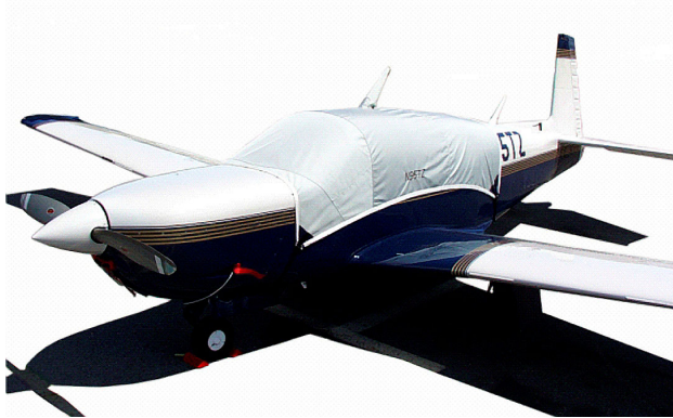
Porsche Mooney Canopy Cover & Plugs

This cover type is made from Silver Acrylic Sunbrella canvas and is 100% lined with a soft and smooth microfiber. Bruce's Custom Covers developed this material combination especially for aircraft protection. The outer material is medium weight and treated for water resistance, UV resistance and anti-static buildup. The inner lining is a very soft and smooth microfiber to prevent scratching. The material is very reflective, and tests show that the cabin interior temperature can be reduced to near-ambient temperature on the hottest of days. It is water, ice and snow repellent, yet breathable to allow moisture to escape from between the cover and the aircraft surface.