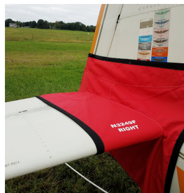
Mooney M20E Tailcone Cover