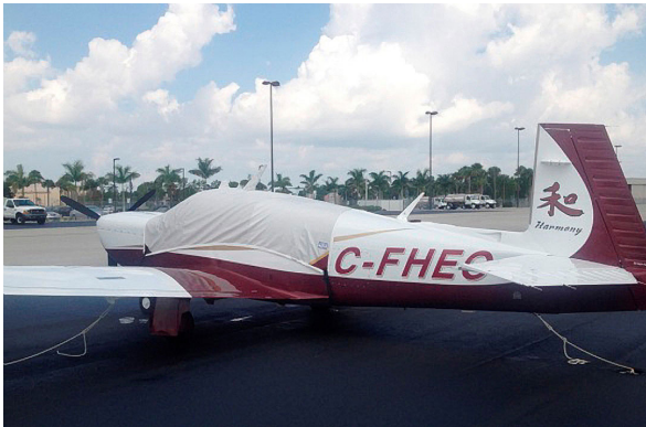
Mooney TLS Canopy Cover

Travel Covers are made with Silver Solution-Dyed Polyester fabric and only lined over the windshield to save weight. The material is lightweight and more compact for easy stowage in the aircraft. The polyester material is water resistant, but only intended for occasional use outside. We also have an ultra lightweight material available for fitted hangar dust covers. For daily outdoor use, the non-travel Sunbrella Cover is the best choice.