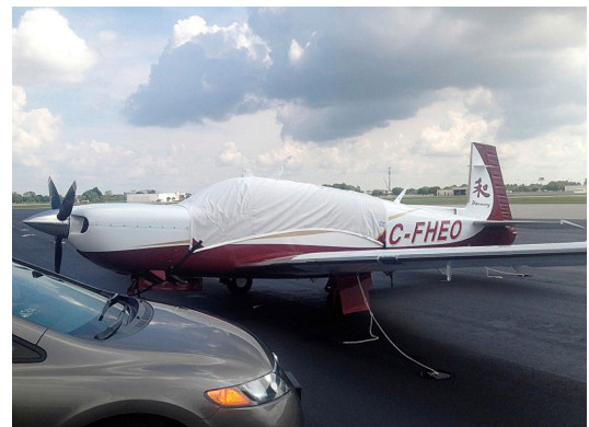
Mooney TLS Canopy Cover