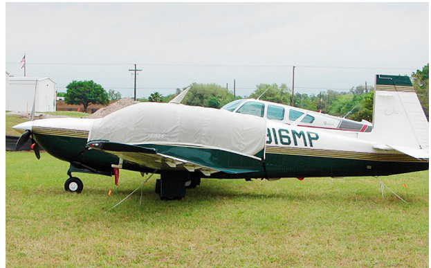
Mooney Ovation Canopy Cover