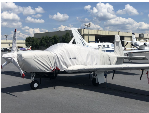
Mooney M20TN Acclaim Full Cover Set

WINTER USE MATERIAL - Made with Solution-Dyed Polyester fabric, this option is intended for seasonal use to aid in deicing, rain mitigation, or for occasional travel. The material is lighter and more compact, but more susceptible to UV damage and may have a shorter useful life if used continuously outside than the all-year use material.