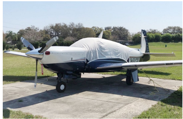
Mooney Ovation Canopy Cover