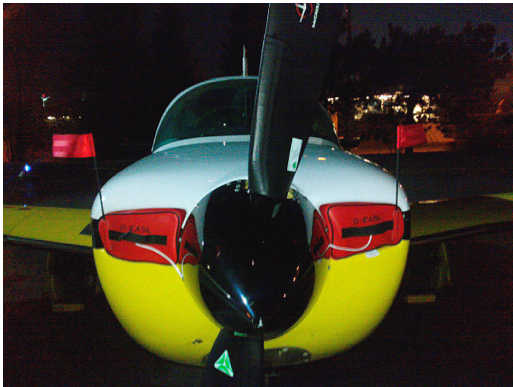
Mooney 231 Engine Inlet Plugs

Engine Inlet Plugs are custom fit for your Mooney Eagle intakes, made with heavy-duty vinyl material, and stuffed with a single block of sculpted urethane foam. Each plug has a zipper that allows the foam to be removed and dried if necessary. Engine plugs have warning flags that are visible from the cockpit or 'remove before flight' streamers sewn onto the face of the plugs. Most plugs are imprinted with the aircraft registration number in black for an extra charge. Storage bag NOT included. Engine plugs may be inserted after flight when the engine is still warm. Engine Inlet Plugs are commonly referred to as Cowl Plugs, Intake Plugs, Cowl Blocks, Engine Blocks, and Engine Bungs.