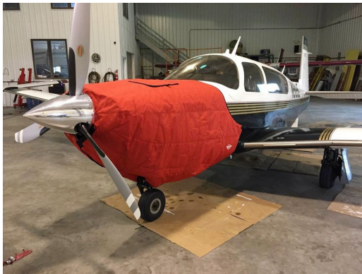
Mooney Ovation Insulated Engine Cover

This cover type is made from Silver Acrylic Sunbrella canvas and is 100% lined with a soft and smooth microfiber. Bruce's Custom Covers developed this material combination especially for aircraft protection. The outer material is medium weight and treated for water resistance, UV resistance and anti-static buildup. The inner lining is a very soft and smooth microfiber to prevent scratching. The material is very reflective, and tests show that the cabin interior temperature can be reduced to near-ambient temperature on the hottest of days. It is water, ice and snow repellent, yet breathable to allow moisture to escape from between the cover and the aircraft surface.