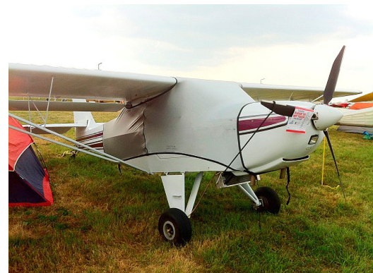
Kitfox Spandex FlyAway Travel Canopy Cover