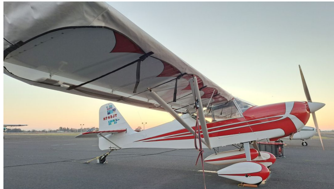
Kitfox Wing Covers