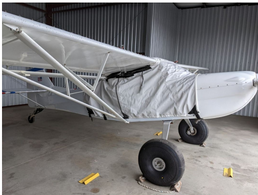
Kitfox Extended Canopy Cover, Over-Top Type

This cover type is made from Silver Acrylic Sunbrella canvas and is 100% lined with a soft and smooth microfiber. Bruce's Custom Covers developed this material combination especially for aircraft protection. The outer material is medium weight and treated for water resistance, UV resistance and anti-static buildup. The inner lining is a very soft and smooth microfiber to prevent scratching. The material is very reflective, and tests show that the cabin interior temperature can be reduced to near-ambient temperature on the hottest of days. It is water, ice and snow repellent, yet breathable to allow moisture to escape from between the cover and the aircraft surface.