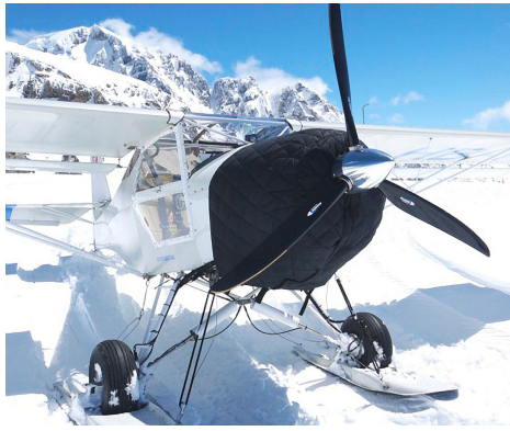
Kitfox Insulated Engine Cover