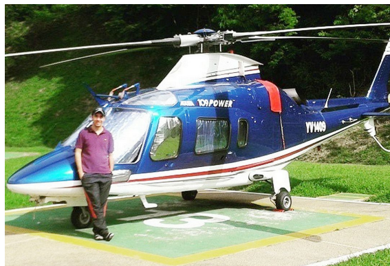
Agusta Power Cockpit & Cabin HeatShields