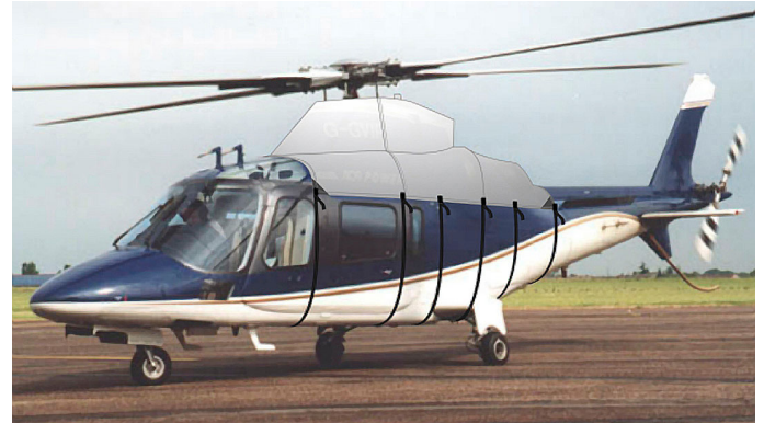
Agusta Power Engine Cover (illustration)