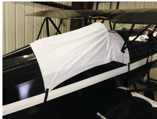
Rose Parrakeet Canopy Cover (test fit cover)