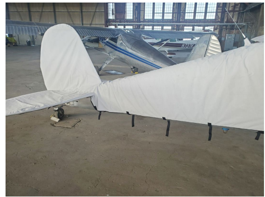
Cessna 140 Empennage Cover