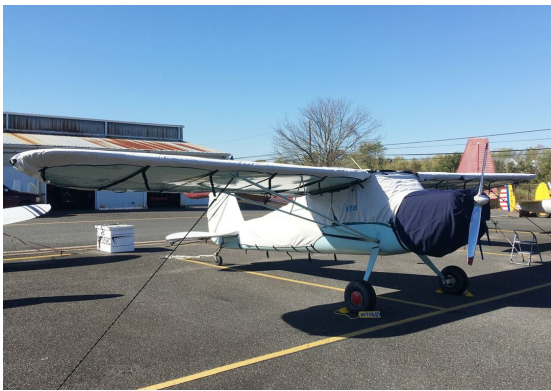
Cessna 140 Canopy, Engine, Wing & Empennage Covers

WINTER USE MATERIAL - Made with Solution-Dyed Polyester fabric, this option is intended for seasonal use to aid in deicing, rain mitigation, or for occasional travel. The material is lighter and more compact, but more susceptible to UV damage and may have a shorter useful life if used continuously outside than the all-year use material.