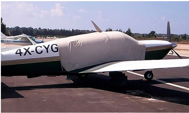
Mooney M20 Extended Canopy Cover

This cover type is made from Silver Acrylic Sunbrella canvas and is 100% lined with a soft and smooth microfiber. Bruce's Custom Covers developed this material combination especially for aircraft protection. The outer material is medium weight and treated for water resistance, UV resistance and anti-static buildup. The inner lining is a very soft and smooth microfiber to prevent scratching. The material is very reflective, and tests show that the cabin interior temperature can be reduced to near-ambient temperature on the hottest of days. It is water, ice and snow repellent, yet breathable to allow moisture to escape from between the cover and the aircraft surface.