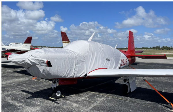
Mooney M20K Extended Canopy/Engine Cover, Prop Cover

This cover type is made from Silver Acrylic Sunbrella canvas and is 100% lined with a soft and smooth microfiber. Bruce's Custom Covers developed this material combination especially for aircraft protection. The outer material is medium weight and treated for water resistance, UV resistance and anti-static buildup. The inner lining is a very soft and smooth microfiber to prevent scratching. The material is very reflective, and tests show that the cabin interior temperature can be reduced to near-ambient temperature on the hottest of days. It is water, ice and snow repellent, yet breathable to allow moisture to escape from between the cover and the aircraft surface.