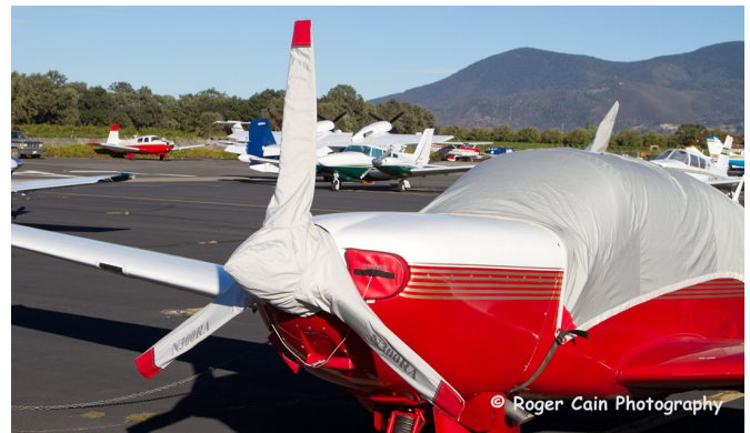
Mooney M20M Bravo 3-Blade Prop Cover, Engine Plugs