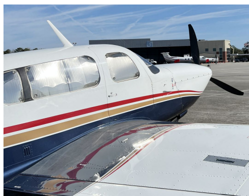
Mooney M20S Heatshield Set

Windshield Heatshields are interior sunshades for an aircraft's front windshield. The product is a unique composite of closed-cell foam with a silver mylar finish. The semi-rigid design is stiff enough to stand along the inside of the windshield using sun visors or window framing. It folds up flat and easily stores in the included storage sleeve. Some designs may require velcro and suction cups or split right and left sides. A Heatshield is an excellent short-term remedy for cockpit overheating. An external fabric cover is far more effective and practical for long-term protection.