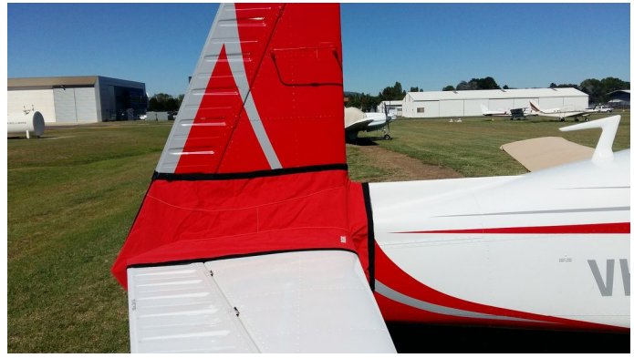
Mooney M20J Tailcone Cover