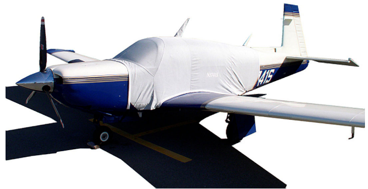
Mooney Extended Canopy Cover